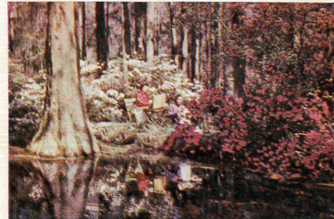
CYPRESS . . . "out of this world, an inspiration . . ."