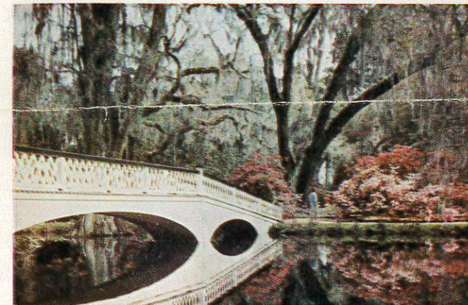
MAGNOLIA . . . "spectacular bloom unmatched in beauty . . ."