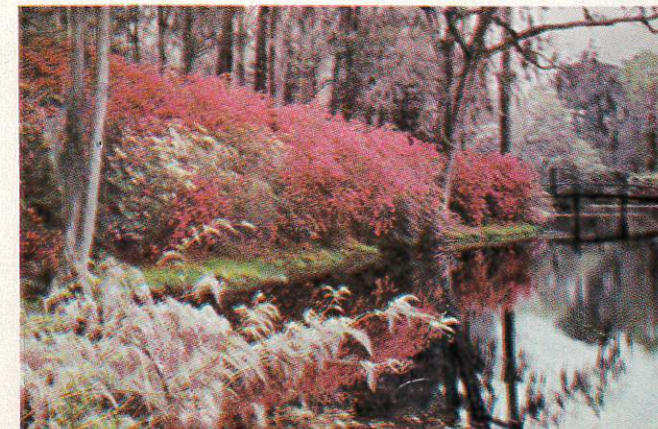
MIDDLETON . . . "America's oldest landscaped Gardens . . ."