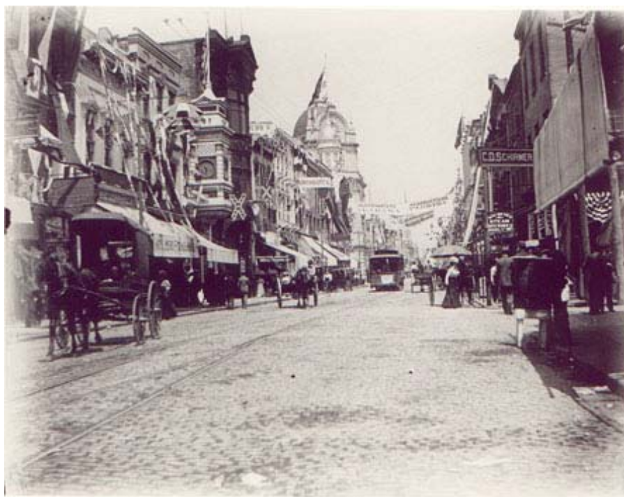
King Street, ca. 1900* 2004.021.035