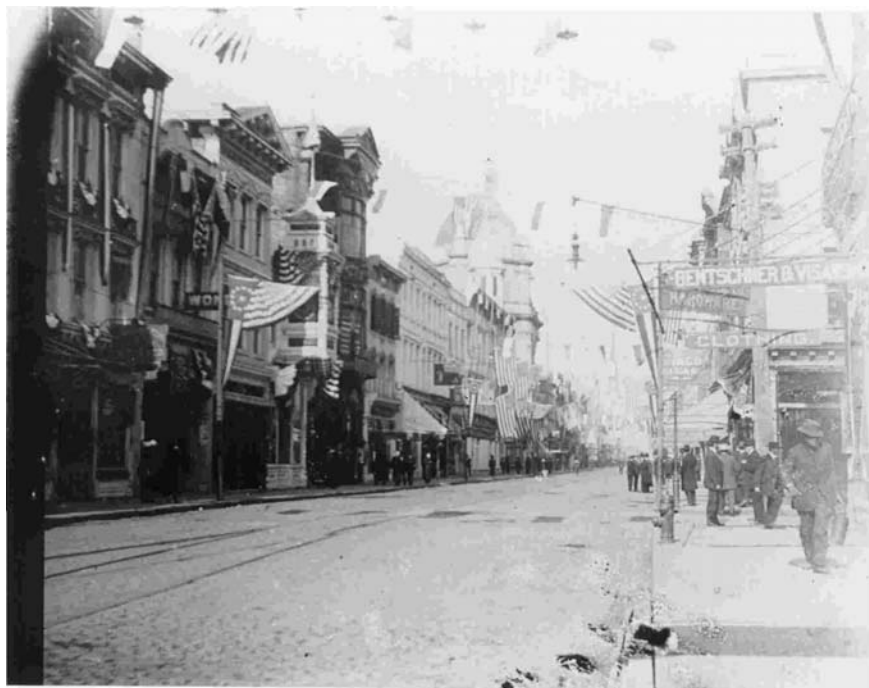
King Street, 1912* 2004.021.037