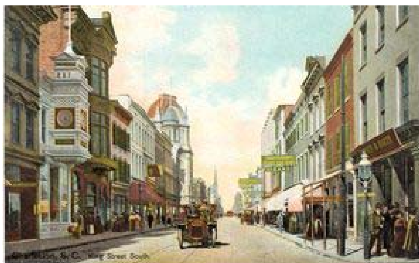
King Street, early 20 th c.* 2009.013.16