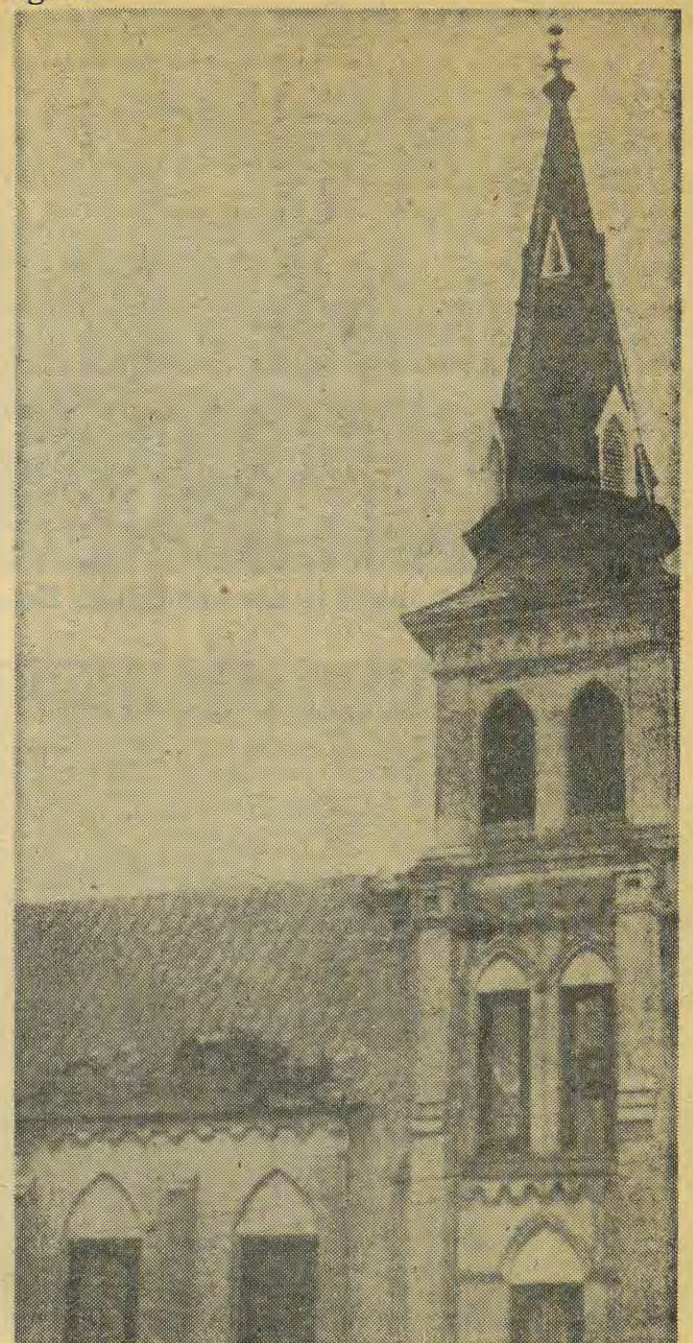
Calhoun Street church roof ripped.