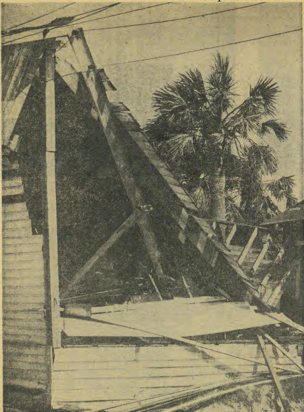
Wall crumples; roof tumbles