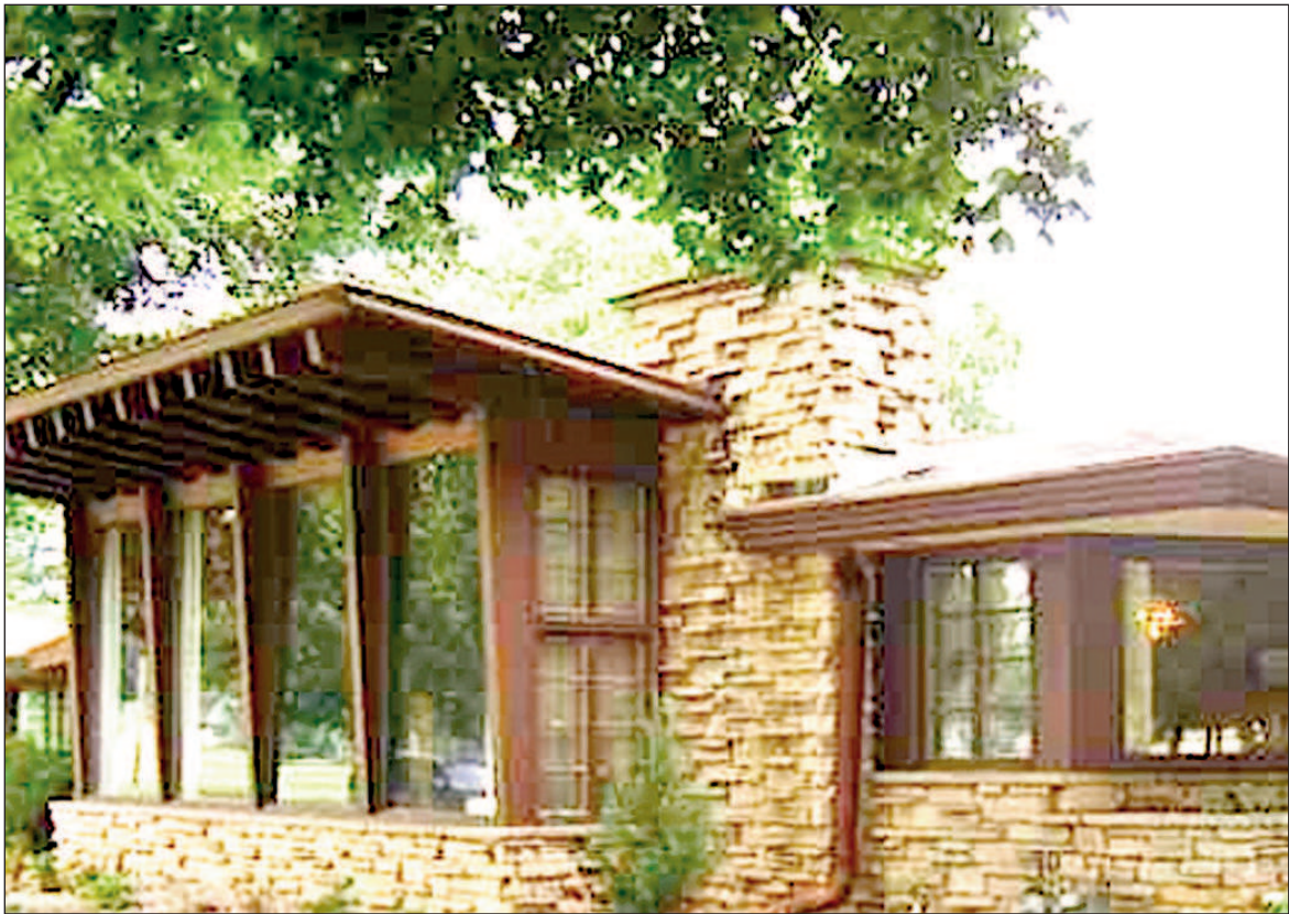
THE EXTERIOR OF the house at 954 Watson St. remains intact as it originally was designed in 1952.