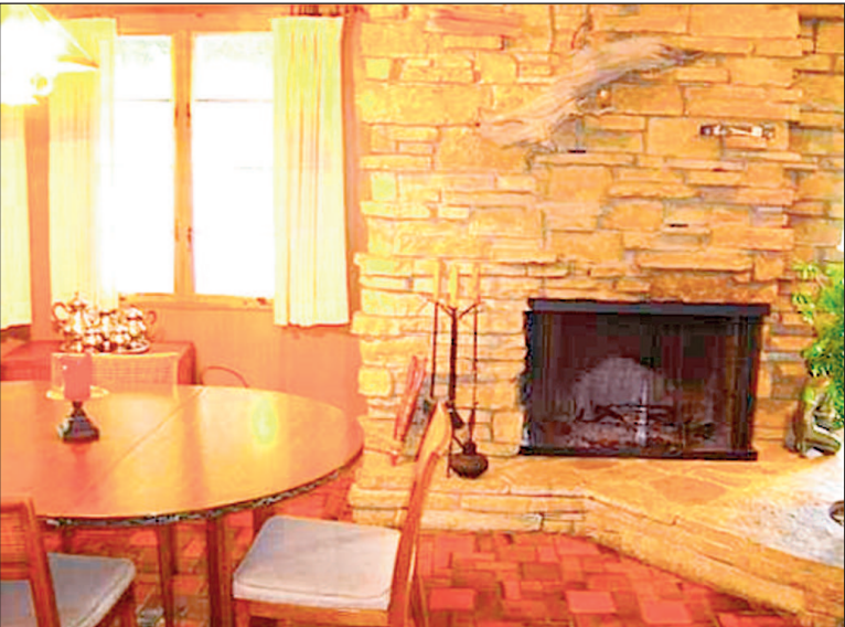
THE DESIGN INTEGRITY of the house’s interior includes mixed materials and many built-in pieces of furniture submitted photo

amazon.com among other sites. is open Fridays and Saturdays 10 a.m. to 1 p.m. For more information follow us at Facebook/riponhistory or www.riponhistory.org. The Ripon Historical Society is the oldest continually operating historical society in Wisconsin. It