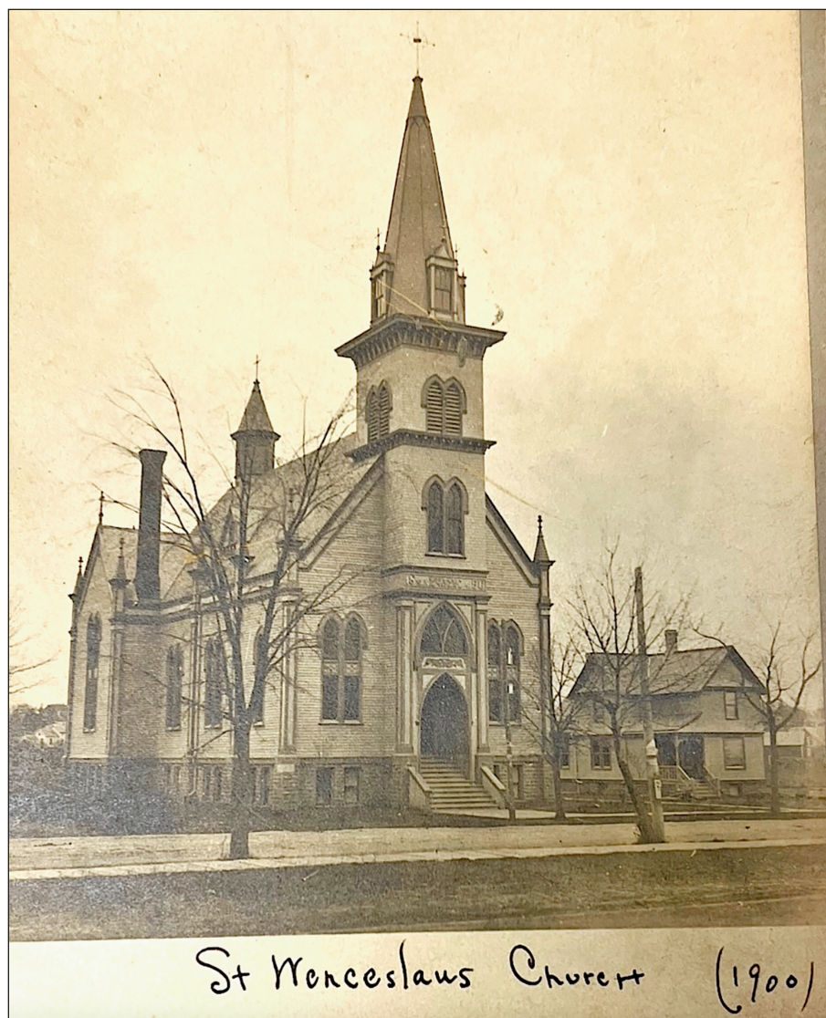
THE ORIGINAL ST. Wenceslaus Church burned in 1896 and was replaced with this stone foundation, brick walls and slate roof structure in 1897.

For more information follow us at Facebook/riponhistory or www.ripon-history.org.