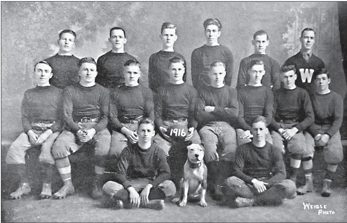
THE RIPON HIGH School football team of 1916 was featured in the first Tiger yearbook of 1917. Ripon High School has been playing football since the early 1900s.

In 1926, RHS joined the Little Ten League. This was nicknamed The Holiday League due to various school colors. Ripon was known as Halloween due to its school colors of orange and black, having red and green school colors Berlin was known as Christmas and Mayville’s school colors were white and red, so they were Valentine’s