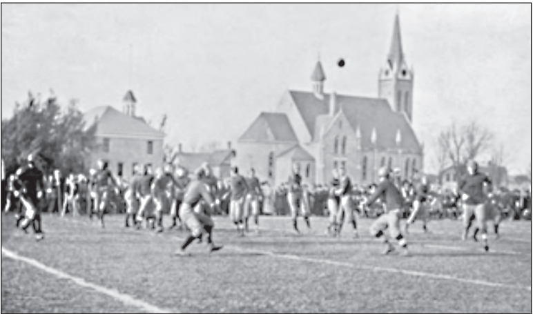
THIS UNDATED PHOTO shows a football game at Ingalls Field. Both the Ripon College and Ripon High School football teams played on the field until Ripon College built Hopp Stadium on campus in 2023. Seen in the background is the former St. Wenceslaus Catholic Church and school.