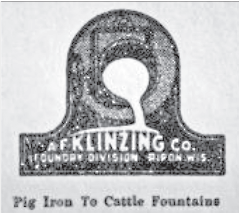
THIS COMPANY LOGO comes from 1953 and reads “A.F. Klinzing Co., Foundry Division, Ripon, Wis.” and below this reads “Pig Iron to Cattle Fountains.”