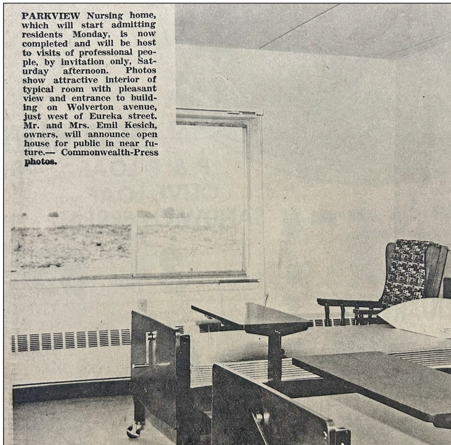
THE RIPON COMMONWEALTH Press from July 23, 1964 ran this photograph of a room at the new Parkview Nursing Home, which was opening at 50 Wolverton Ave.