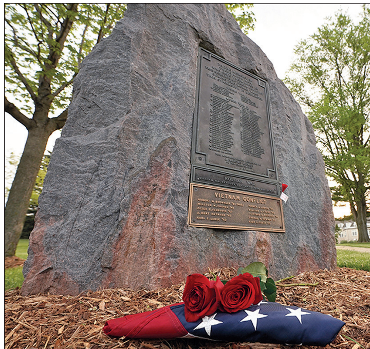
RIPON COLLEGE'S WAR memorial, found on Seward Street, commemorates the alumni who gave their lives in service to their country from World War I onward. It lists 10 alumni who died in the Vietnam War and their class year.