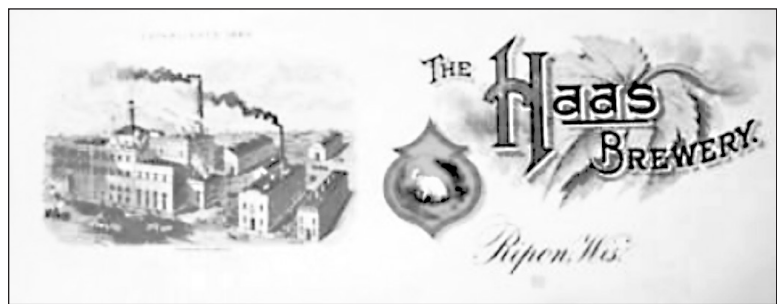
BY 1880 THE Haas Brewery sold an average of 1,200 barrels of beer annually.

"Well Art, if that is the case, I'm sure we'll need fifty dollars more or what do you say about sending John's checkbook. I don't know what to suggest be-