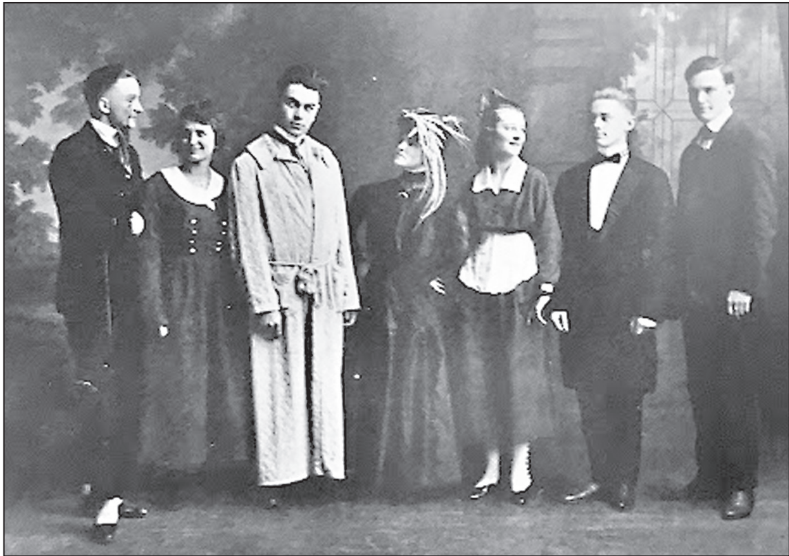
THE RIPON COLLEGE Mask and Wig organization performs "The Dressing Gown", in March 1919.

Looking back with the Ripon Historical Society