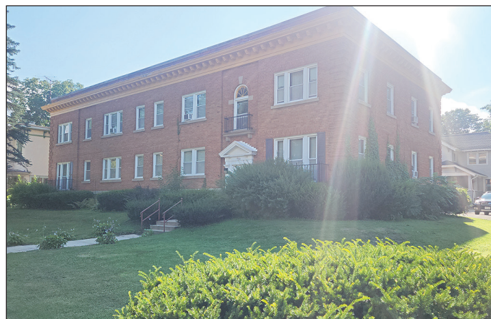
SELFDRIDGE APARTMENTS SIT on the corner of Watson and Watertown streets in Ripon. It was built in 1928 as the "All Modern' Apartment House."

An October 1928 Ripon Weekly Press noted that "Each apartment has four rooms and bath, living room with a disappearing bed, dining alcove, kitchen and bedroom. Built in cabinets have space and area