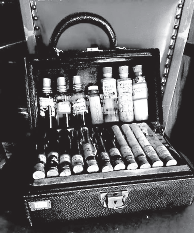
A DOCTOR'S HOUSE call bag included medicine and supplemental treatments for use in case of emergencies and illnesses.

For more information follow us at Facebook/riponhistory or www.riponhistory.org.