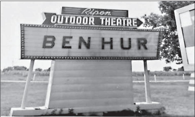
THE RIPON OUTDOOR Theatre offered a popular family activity in the 1950s and 1960s. The movie "Ben Hur" was shown in 1959.