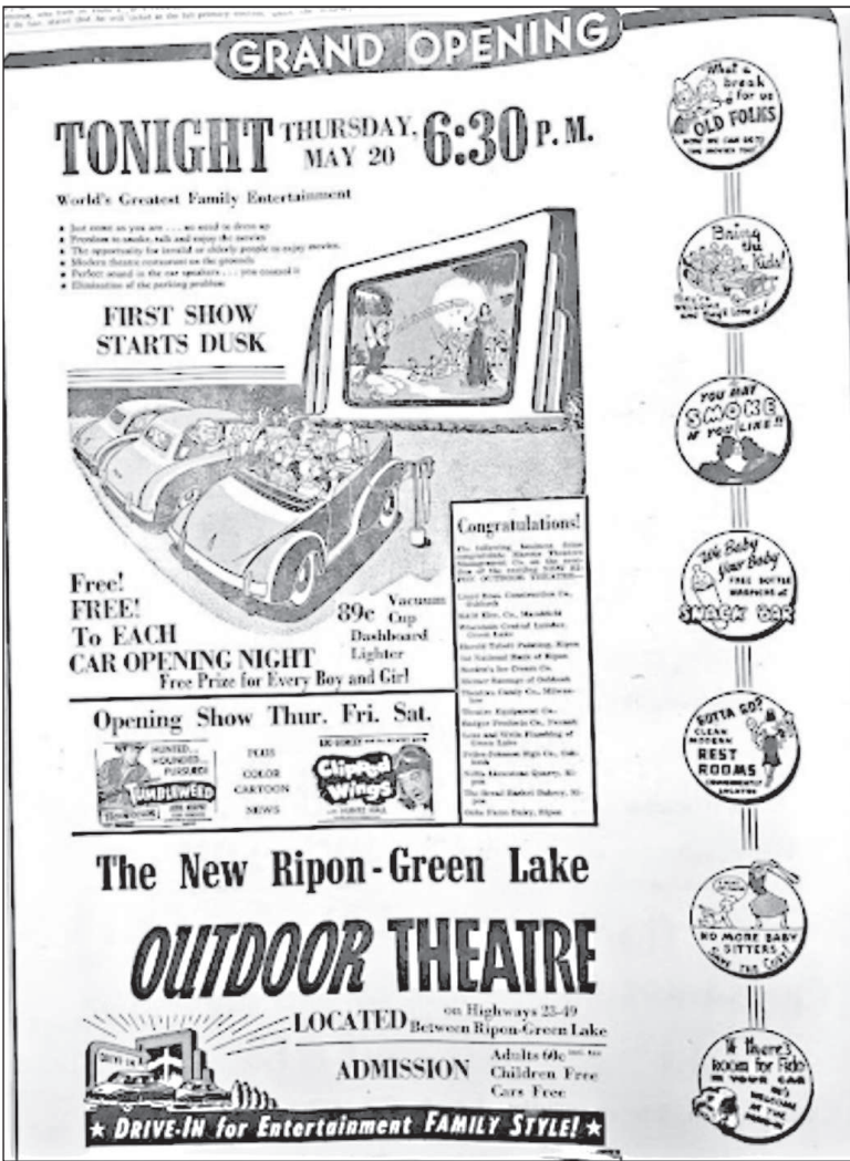
THIS 1954 RIPON Commonwealth Press advertisement informed readers about the Ripon Outdoor Theater grand opening.