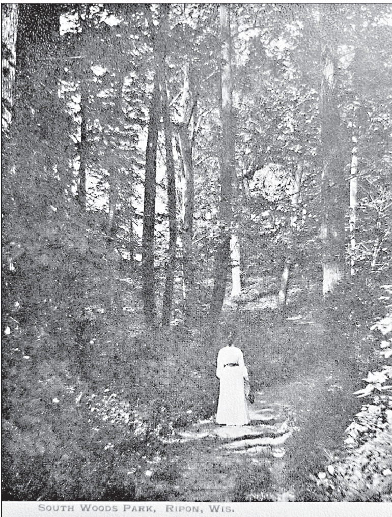
POSTCARDS OF A woman walking into beautiful South Woods were sold in 1923.