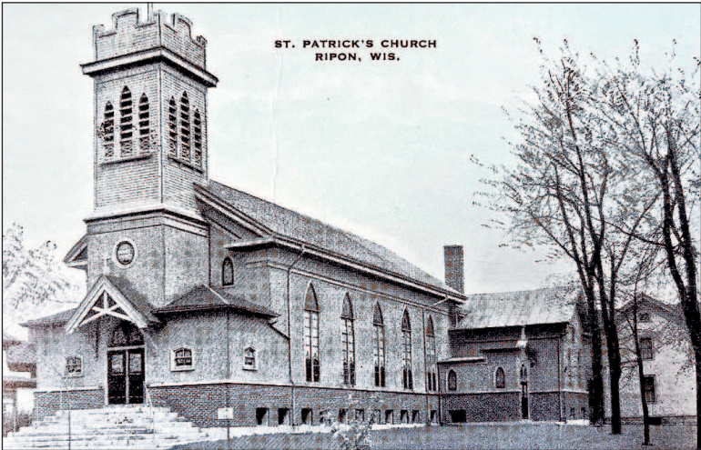
ST. PATRICK'S CHURCH sits on its new foundation after it was moved. The bell tower and façade also were reconfigured. This building was eventually demolished and its parish merged with St. Catherine of Siena in 2005.

Nuns were founded by regions and communities. They grew from approximately 900 individuals in 1840 to 135,000 by 1900. By 1965, there were approximately 180,000 Catholic nuns in the United States. Due to a current decline in individuals