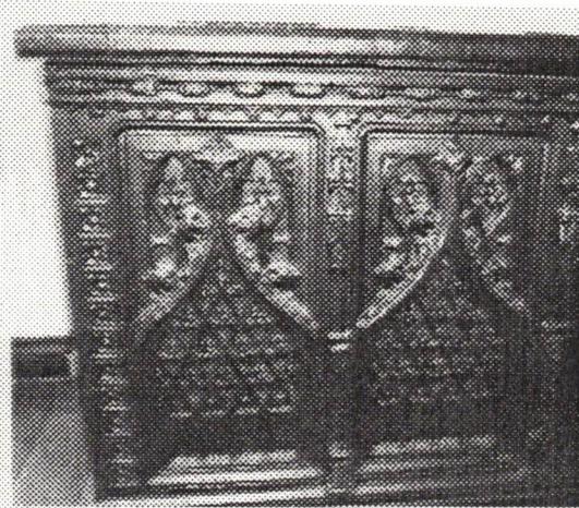
Dining Room South Wall Carved Chest NOT ORIGINAL TO HOUSE : NEUHOFF COLLECTION