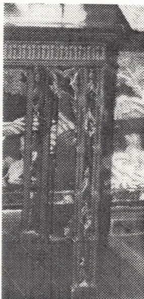
Dining Room Chippendale Table North Wall West

William Clark: reset loose chevrons in two legs, replaced other chevrons and touched up finish. Possibly made in Chippendale's shop. Received damaged from RD Coe estate.