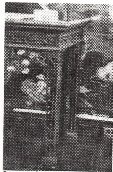
Leg and apron detail.