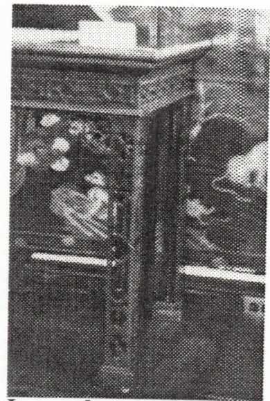
Leg and apron detail.