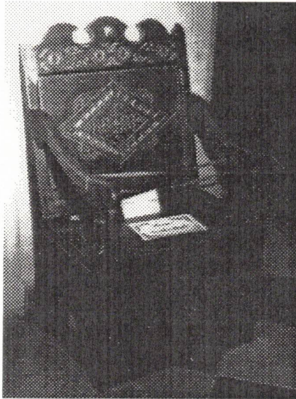
Chair east side