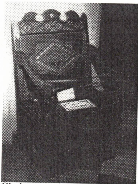
Chair east side