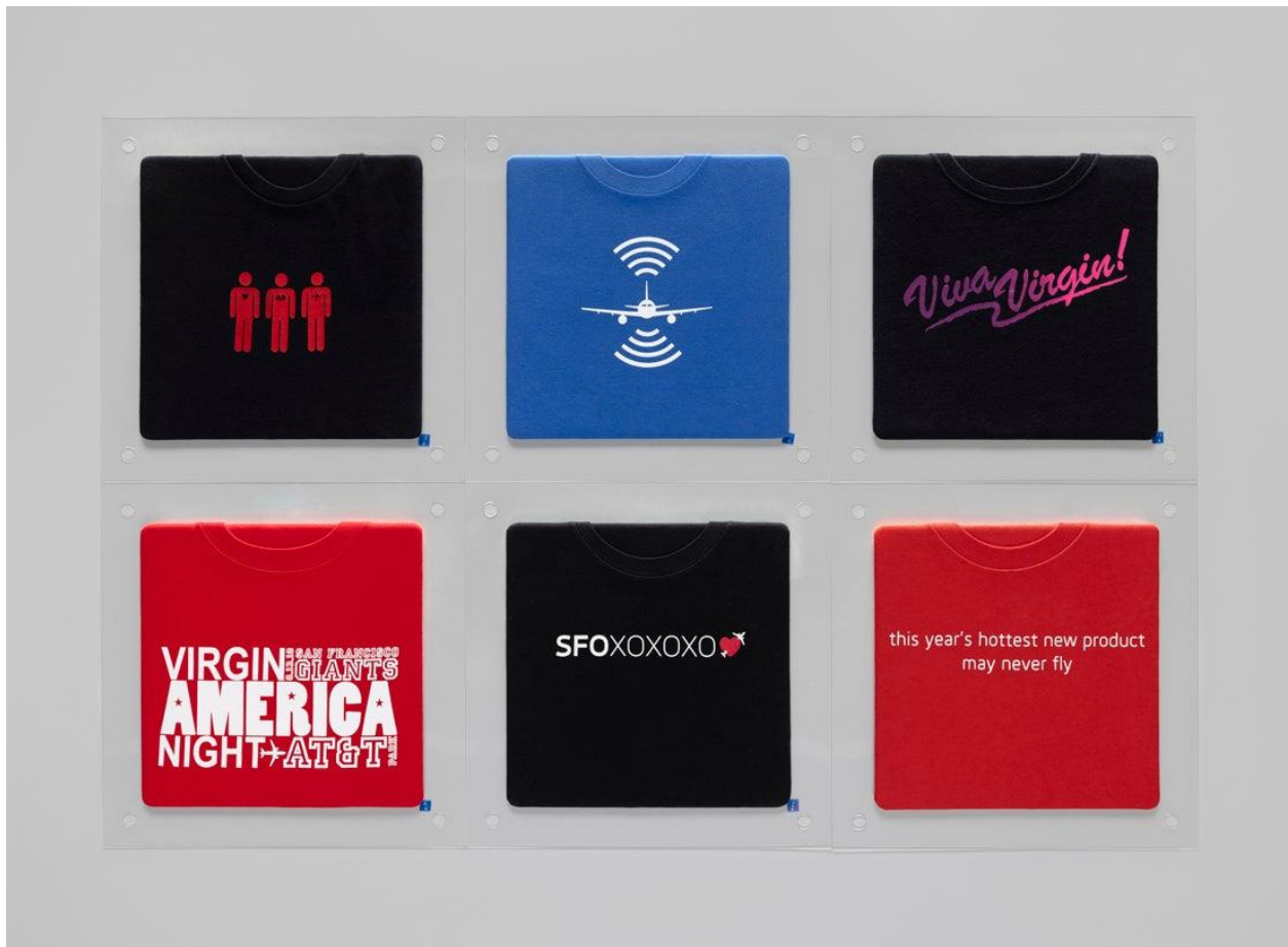
Virgin America t-shirt display 2007–c. 2017