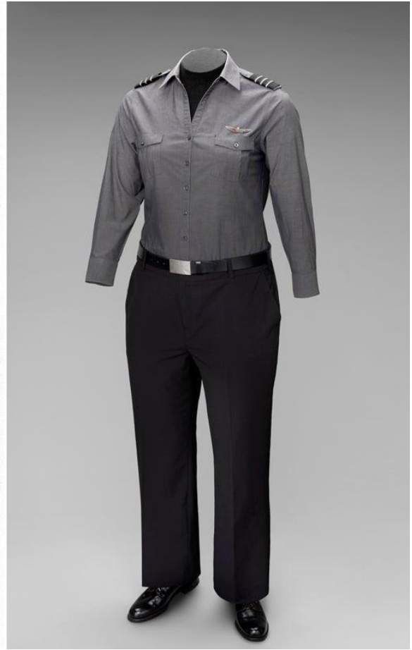
Virgin America female flight officer uniform c. 2016