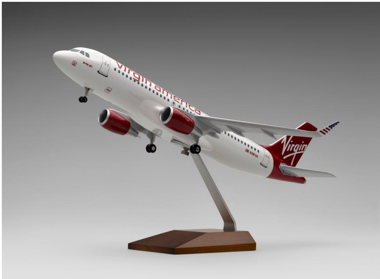
Virgin America Airbus A320-214 Jersey Girl model aircraft c. 2010