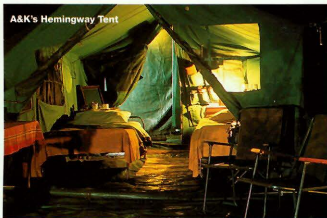
A&K's Hemingway Tent

You could just about run a herd of wildebeest through the gap between Abercrombie & Kent and the rest of the contenders. A&K, which organizes high-comfort adventure tours to destinations around the world, came out tops in every category: wildlife sightings, staff/guides, travel arrangements, lodgings, and meals. The smaller Ker & Downey, well known for its custom safaris, came in second throughout.