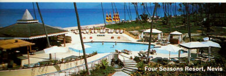
Four Seasons Resort, Nevis