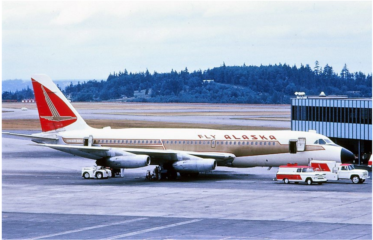
AS CV-800 N8477H