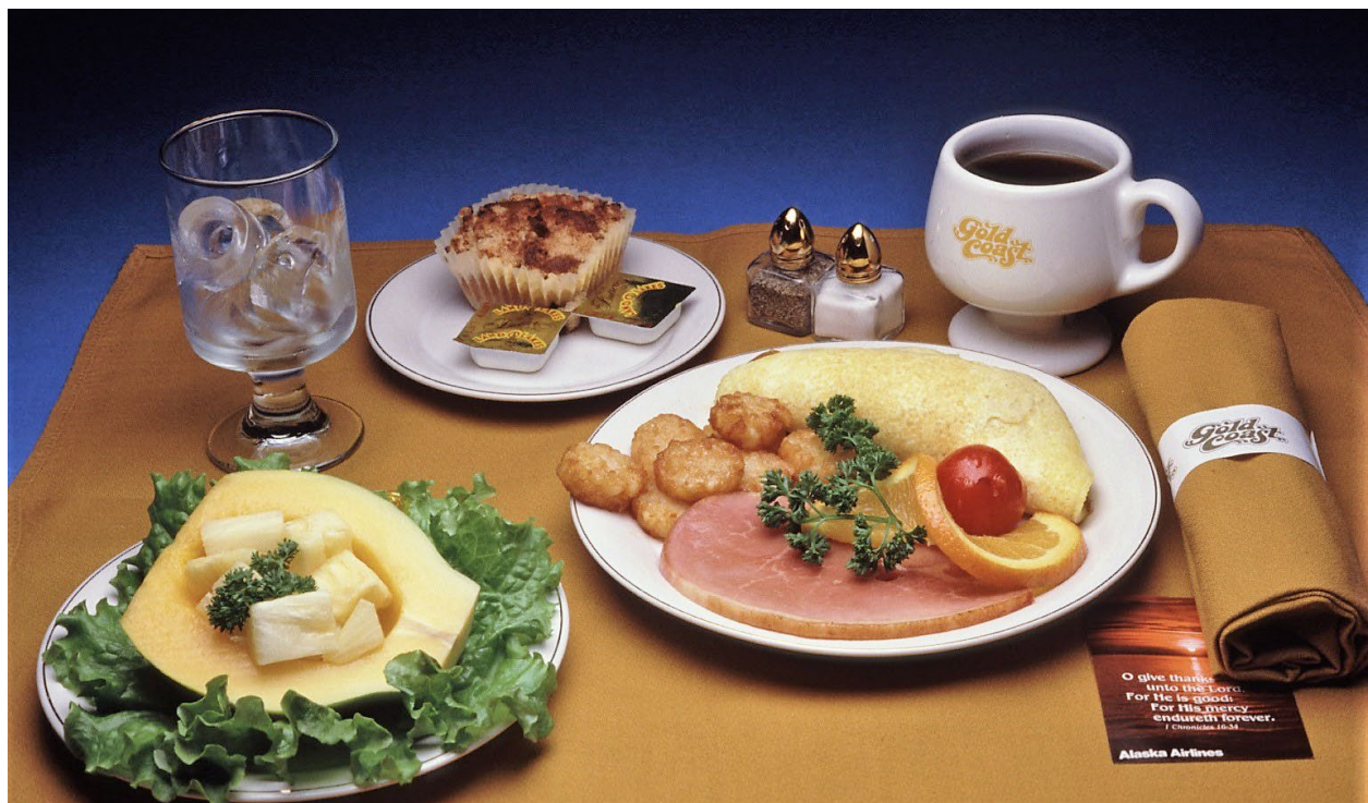
AS Gold Inflight Service