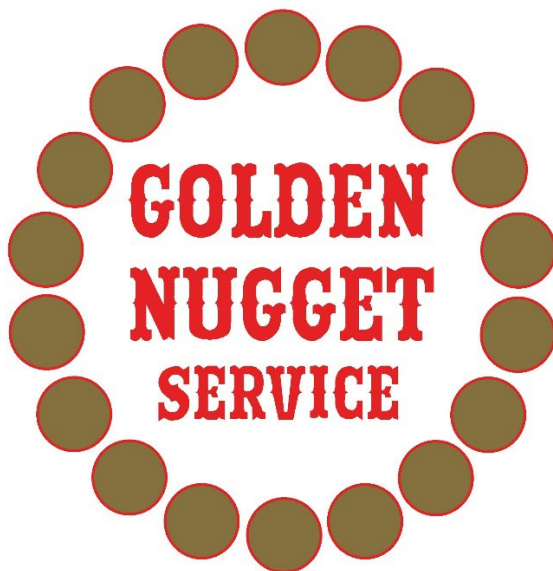
Golden Nugget Service Logo