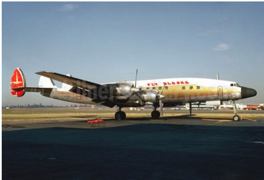
Alaska (Fly Alaska) 1649A N7316C (61) (Grd) SEA (JGC)(46)-S