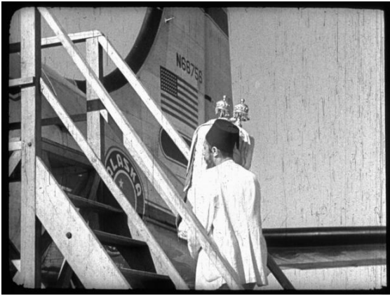
A Rabbi carries a Torah onto an Alaska Airlines plane during "Operation Magic Carpet" in 1949.

Read more here: http://www.adn.com/2014/06/20/3527120/artbeat-arab-jewish-refugee-speaks.html#storylink=cpy