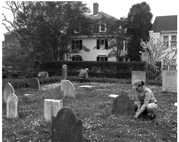
Last year's "Spring Cleanup" at the Cemetery