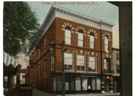
A postcard view of Fr. Mathew Hall at 398 Thames St., circa 1909

The Carpenters Union held its meetings at the Hall until the late 1970s. In 1981 a suspicious fire badly damaged the building and led to its demolition. 4 In 1986 the Mercy Sisters' former convent was moved from Spring Street to this site and converted into a bed and breakfast, the Admiral Fitzroy Inn.