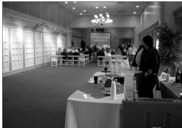
A view of our spacious new lecture venue at the Tennis Hall of Fame