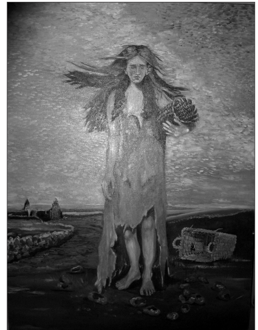
"Famine Girl" by Rosemary Kavanagh O'Carroll, 2002. Oil on canvas, 30 X 40 inches.

While visitation to the Center during its first season was encouraging, we hope for an increase in attendance in 2012 through stronger marketing and word-of-mouth. We have printed and distributed a significantly larger number of "rack cards" touting the Center as an attraction for those interested in Irish history and culture. Points of distribution include the Newport Visitors Center on Americas Cup Avenue, the Middletown AAA Travel office and numerous local hotels and B&Bs. Artwork and printing costs were underwritten by a grant. In addition, a 2-month, targeted radio campaign of 60-second commercial began on June 28. The spots are running on WADK, 1540 AM on Rick Kelly's Saturday afternoon "Irish Hours" show, as well as at other times.