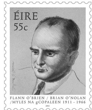
The commemorative stamp celebrating the centenary of the birth of the writer was issued in 2011.

Flann O'Brien is the pen name of the Irish novelist and poet born Brian O'Nolan (1911-1966). This poem, one of O'Brien's best-known writings, is from his 1939 novel At Swim-Two-Birds , widely considered to be his masterpiece. "A pint of plain is your only man" would suggest that a pint of stout can solve all your problems.