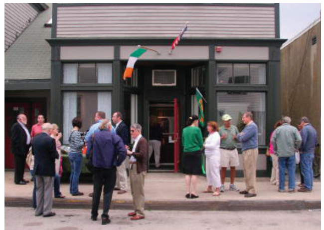
Visitors gather outside the Interpretive Center on opening day.