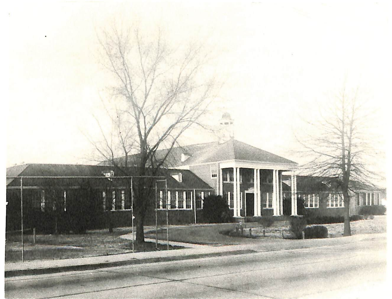
POCOMOKE HIGH SCHOOL POCOMOKE CITY, MARYLAND