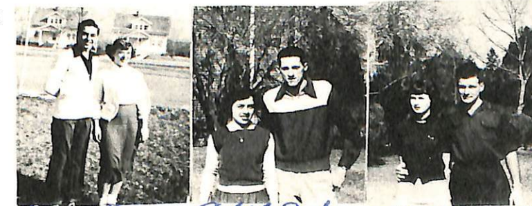
Pat Pat Prettiest Smile