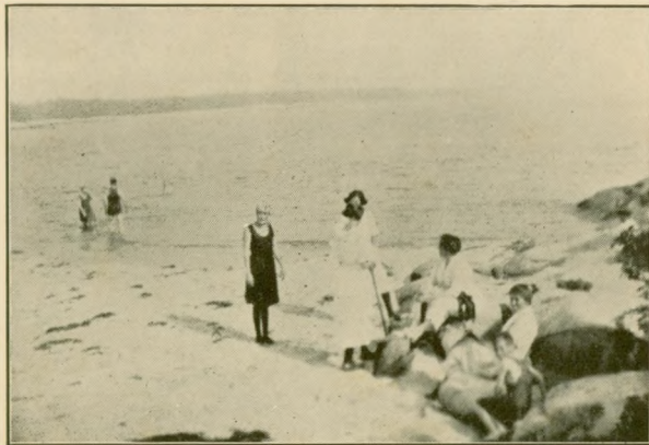
THE SANDS BEACH

products, vegetables and berries are raised and grown on the place. The proximity to the water front assures one of the choicest of clams, lobsters and all kinds of fresh fish.