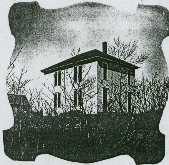
Corea School House - 1908 -

Burned With All Its Contents. Loss About $7000—Other Property Threatened.