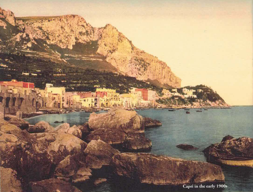
Capri in the early 1900s