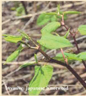
Invasive: Japanese Knotweed

Once invasive plants take over a landscape, wildlife and biodiversity suffer. Native animals no longer have the food sources and vegetative cover they've adapted to over tens of thousands of years. Invasive plants also can disrupt pollinators from pollinating native plants.