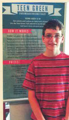
Teen Green teaches Naturalist & Leadership Skills

Teen Green Trail Guide Program: This summer, experienced NBS naturalists will work with teens to develop their naturalist, trail safety and leadership skills. These trainings are fun, active, and engaging. They focus on helping teens build healthy relationships with the environment, exercise, and fellow Trail Guides. In the fall, Trail Guides put their skills to the test and co-lead a series of free, guided naturalist hikes for families. Do you know a teen who might be interested? Applications are available online or at the Welcome Center.