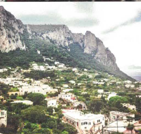
View of Capri today