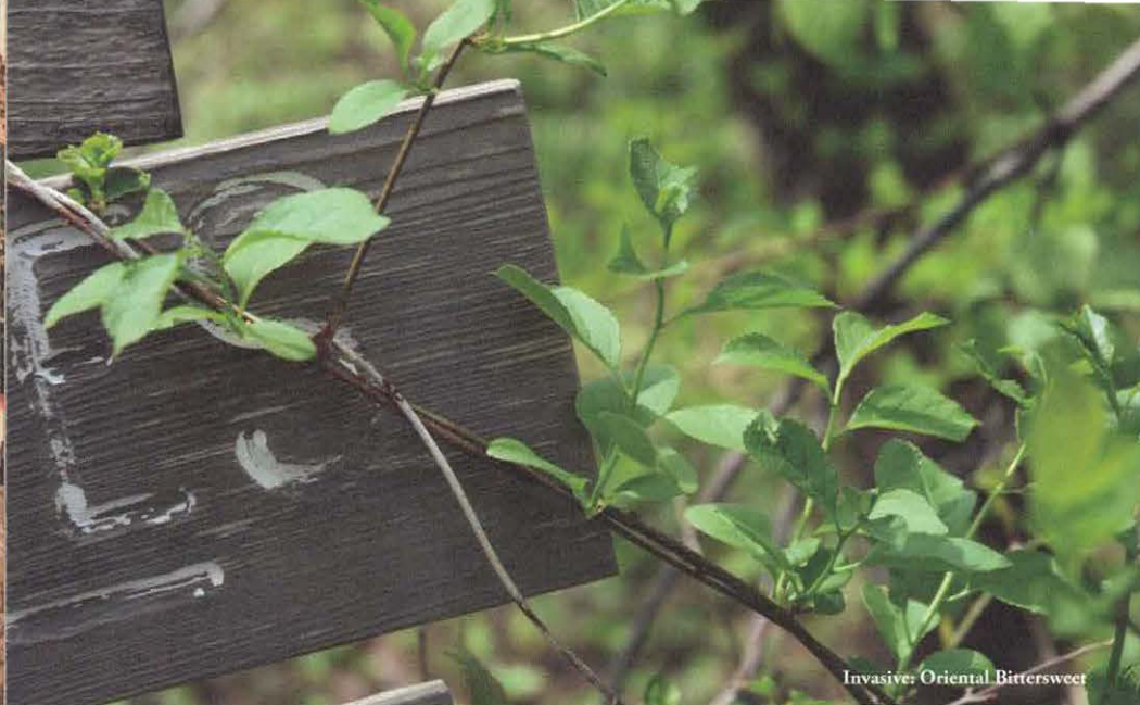
Invasive Oriental Bittersweet