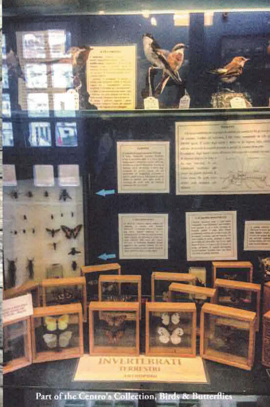
Part of the Centro's Collection, Birds & Butterflies