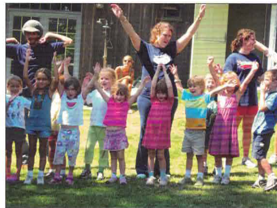
Campers and staff take part in song circle during Summer Camp 2008.

Families searching for summer camp opportunities can go to the NBS website, www.NormanBirdSanctuary.org . Scholarships, multiple child discounts, and payment plans are also available, and families are encouraged to apply.