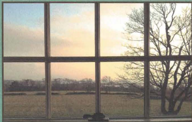
AUTUMN VIEW OUT OF PARADISE FARMHOUSE BEDROOM

It includes: overnight accommodations at our newly renovated & eco-friendly farmhouse, welcome snack & beverages, spa inspired cuisine dinner & brunch, discovery tour, meet our animal ambassadors, naturalist guided bird walk & so much more.