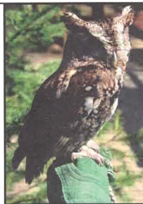
Acorn, an Eastern Screech Owl, is unable to survive in the wild due to an eye injury.

All three birds are housed in the Sanctuary's newly restored aviaries. You can help us welcome our animals to their new home by making "Hawk Housewarming" cards (card making stations will be set up throughout October in the NBS Visitor's Center); animal enthusiasts can also choose to sponsor any of our education animals with our "Animal Adoption" program. Finally, NBS invites school groups to help us name our new red tailed hawk! Names should help to teach something about the animal; one suggestion may be submitted per PreK-12 class. The winning classroom will receive a free NBS Birds of Prey program! Please call or visit our website for an application form and additional details.