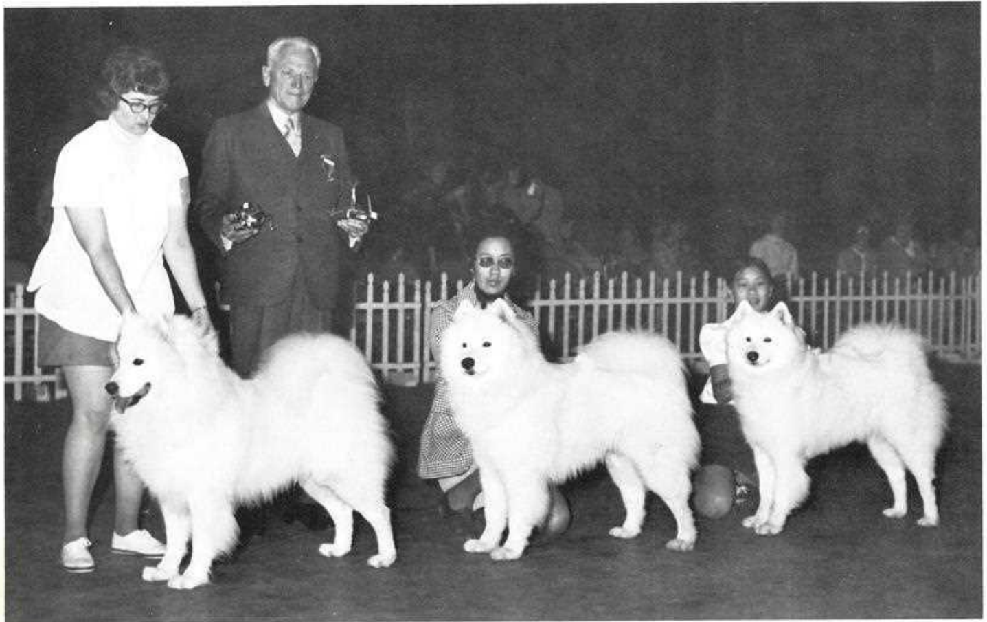
Golden Gate Kennel Club Stud Dog Winner Sire: Am./Can. Ch. Pechenga's Sir Rickshaw Progeny (9-12 months) Ch. Rickshaw's Ksunji of Kalmarli & Rickshaw's Myte Myte