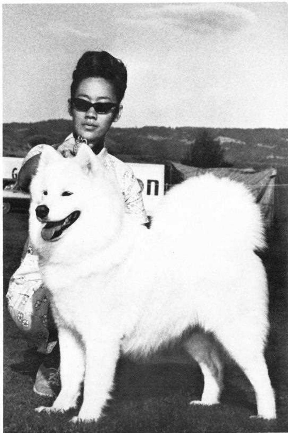
Ch. Czarina Frostina