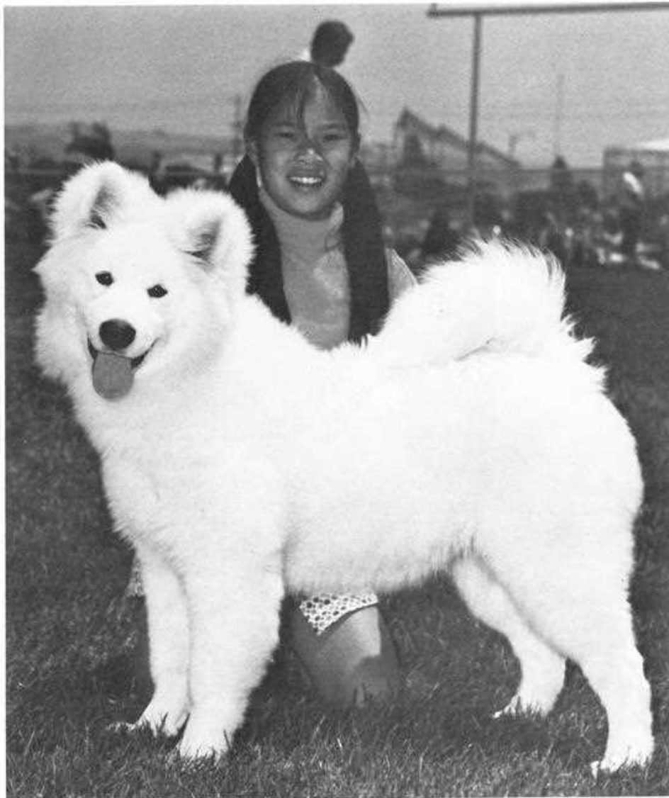
Ch. Samurai's Sumo of Rickshaw (5 months) Ch. Sam O'Khan's Kubla Khan x Ch. Rickshaw's Mandarin Lady

This is a picture of Paul. You can see, he's a little dainty petite