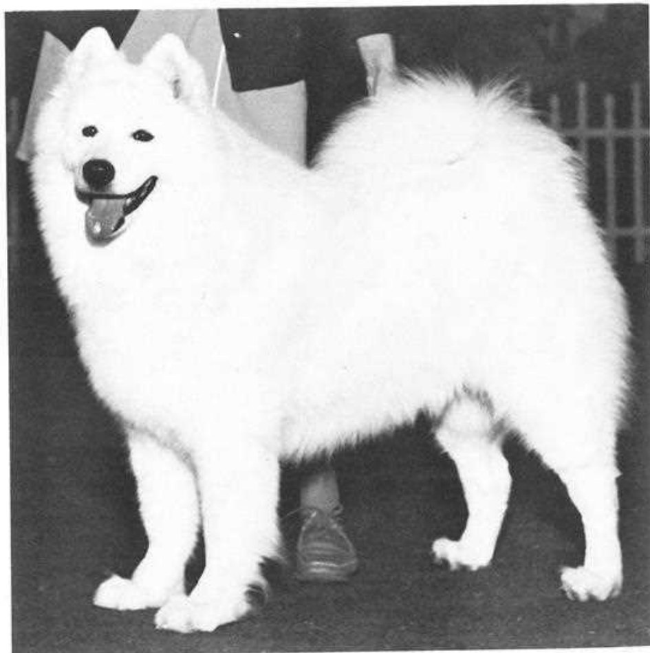
Ch. Rickshaw's Hot Saki - Best of Breed Golden Gate Kennel Club Ch. Syuchan Rho Hari x Williwaw's Byeiei Sosulka