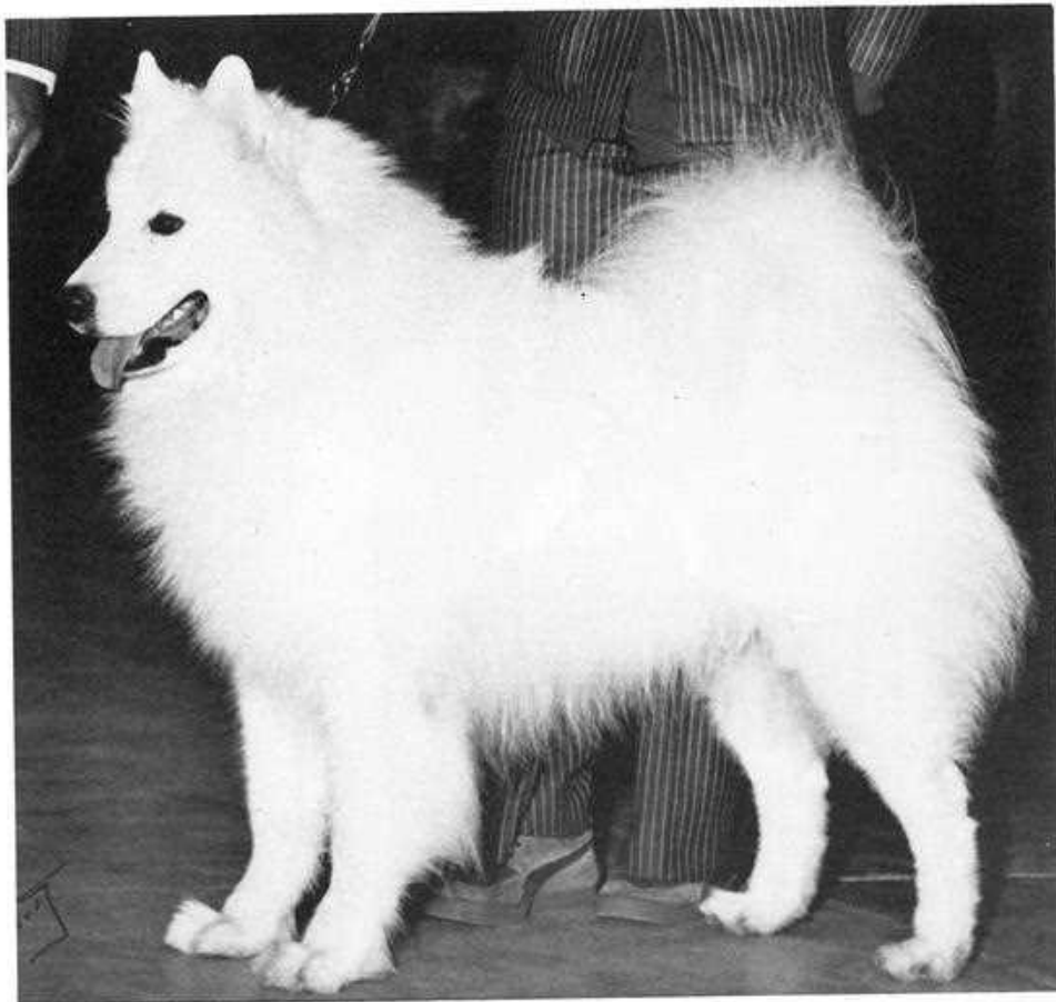
Am./Can. Pechenga's Sir Rickshaw