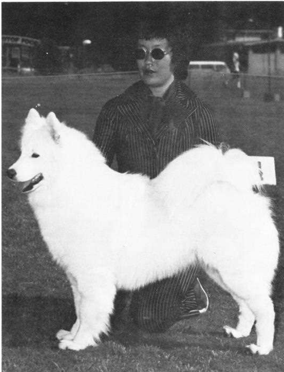
Ch. Rickshaw's Kami Ch. Sam O'Khan's Kubla Khan x Ch. Mister's Bit O' Peaches N' Cream