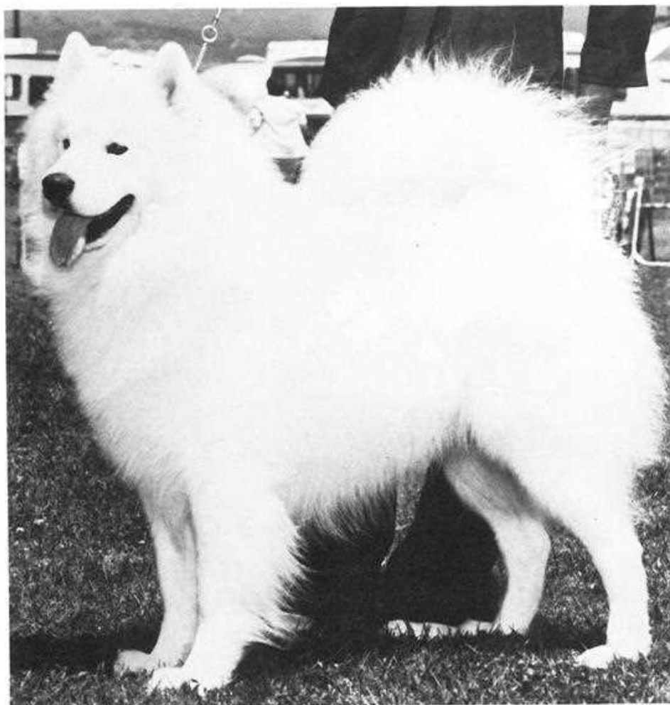
Ch. Rickshaw's Orkdomain Ace Aero Ch. Samurai's Sumo of Rickshaw x Ch. Mister's Bit O' Peaches N' Cream

Barbara: Do you mean like vitamins? Different kinds. We use everything from Forlac to Puppy Nutritional; vitamin E, vitamin C, dicalcium tablets!