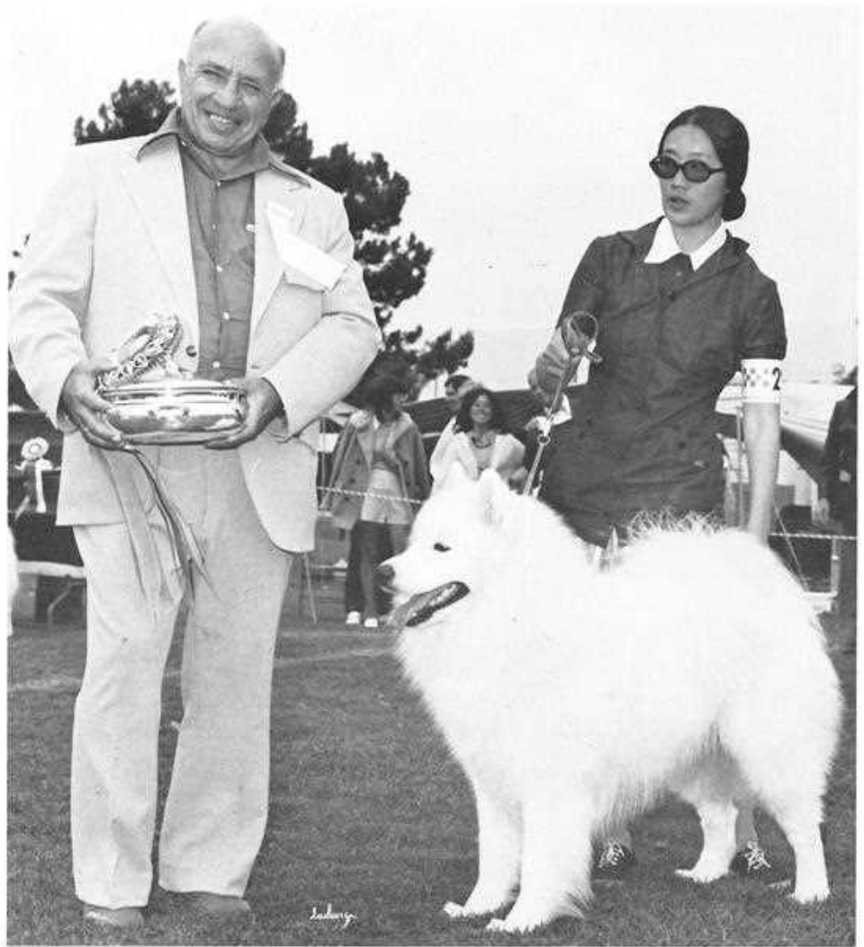
Ch. Rickshaw's Suntori - S.C.L.A. Specialty Best of Breed Winner. Ch. Syuchan Rho Hari x Williwaw's Byelet Sosuka