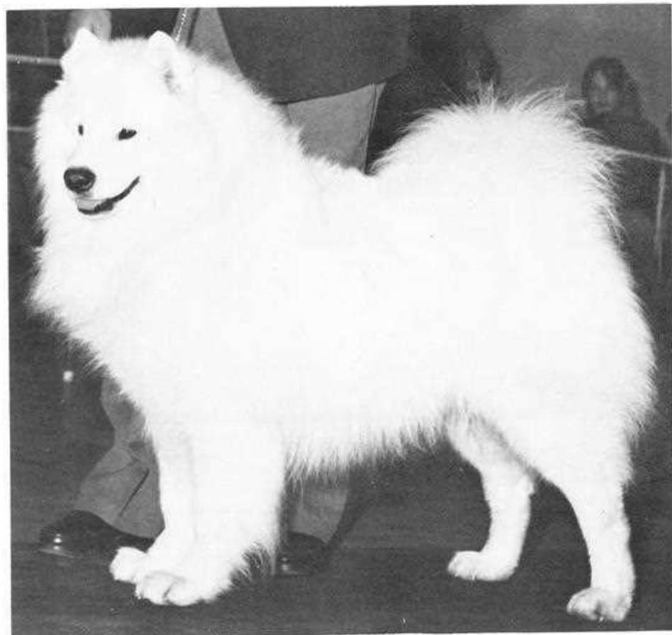
Ch. Rickshaw's Silverblaze Ch. Sam O'Khan's Kubla Khan x Ch. Mister's Bit O' Peaches N' Cream