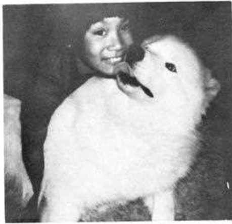
Rickshaw's Willie El (littermate to Ch. Bonfire)

problem with ANY of them until she walks in the door! (laughter)