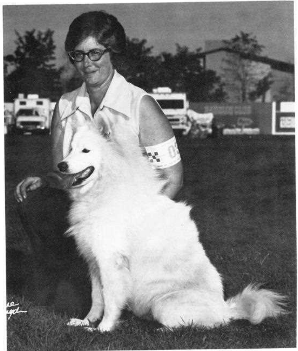
Rickshaw's Sanpan, Am./Can. C.D.