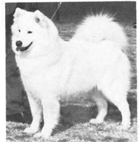
Ch. Mister's Bit O' Peaches N' Cream Ch. Mister Williawaw x Ch. Czarina Frostina