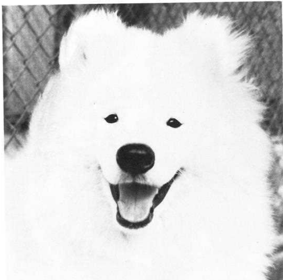
Rickshaw's Top Ace of Sunsan Ch. Rickshaw's Orkdomain Aero x Ch. Rickshaw's Bonfire

certain way of life, and to their people, and I don't believe in carting them off just because they're through doing whatever they can for you.