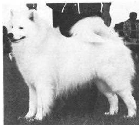
Rickshaw's Top Ace of Sunsan (p.t.d.) Ch. Rickshaw's Orkdomain Aero x Ch. Rickshaw's Bonfire