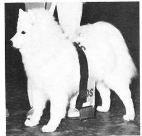
Ch. Rickshaw's Mandarin Lady - Best of Opposite Sex, S.C.A. Specialty, Denver. (Ch. Syuchan Rho Hari x Williwaw's Byebei Sosulka)