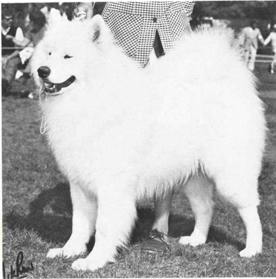
Rickshaw's Victor O' Artic Song Ch. Sam O'Khan's Kubla Khan x Rickshaw's Myte Myte

when we could have been better sports, too, I'm sure! (laughter) But I think that's human nature.