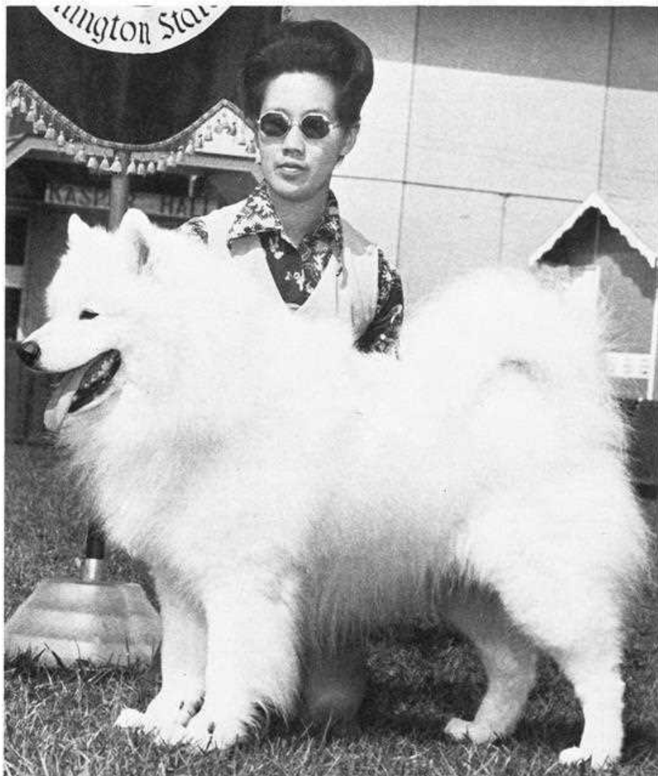
Am./Can. Ch. Rickshaw's Drum Specialty Best of Breed Winner - Sire of several champions from one litter. Ch. Syuchan Rho Hari x Ch. Williwaw's Byebei Sosulka