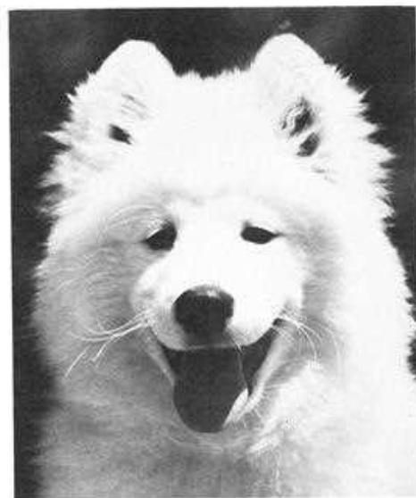
Rickshaw's Sunsprite, aged 3 months.

Barbara: Well, it could all be improved. There were some times