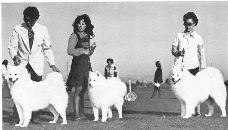
Left to right: Williwaw's Byebei Sosulka, S.C.A. Specialty '72, Best of Breed Winner; Ch. Rickshaw's Mandarin Lady; Ch. Rickshaw's Suntori.

She'd call and say, can you come over and watch them for a couple of hours so that we can go out to dinner?