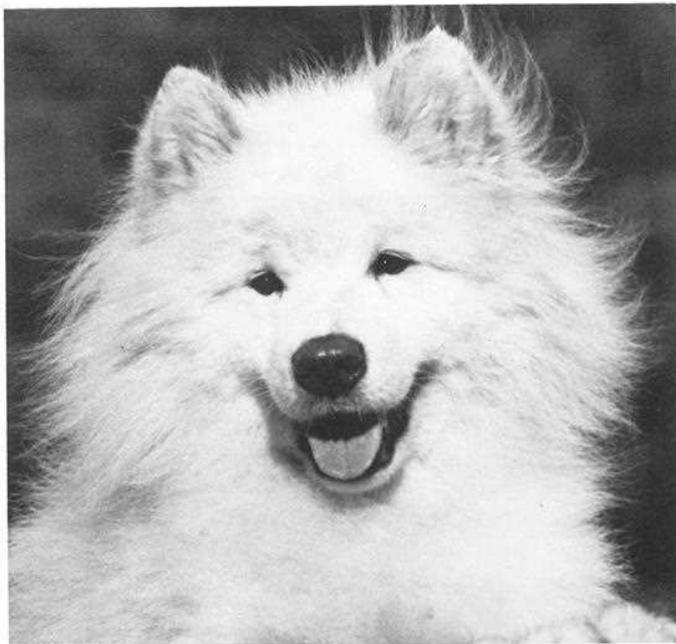
Williwaw's Bit O'Biscuit, C.D. (Cappy) Ch. Czar Nikkolos of Williwaw x Ch. Trushcka of Williwaw

What about ideal Samoyed conformation? Can you describe it?