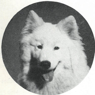
The White Christmas Sams

Snow Maiden of Snowland Kara Kobe of Oceanside Lensen's Snow Chief