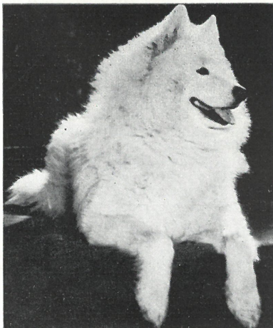
Int. Champion Snowland Stara AT STUD AT HOME

Only 12 Hours to Furthest Point in U. S. by Air