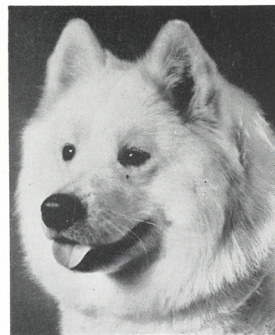
English Champion Janet Jan Mayen