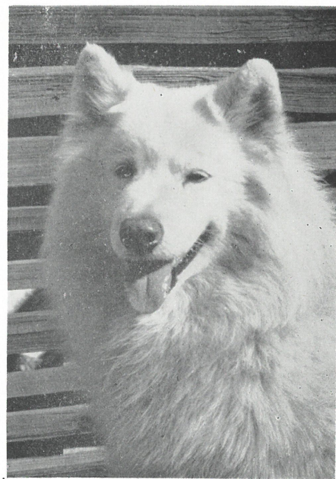
LENSEN'S SNOW CHIEF July 30, 1939—August 1, 1953