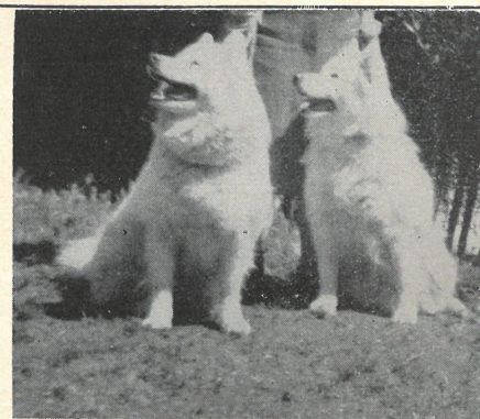
The White Christmas Sams "CRISSY AND CISSY" LENSEN OF SNOWLAND