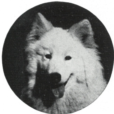
The White Christmas Sams

Snow Maiden of Snowland Kara Kobe of Oceanside Lensen's Snow Chief