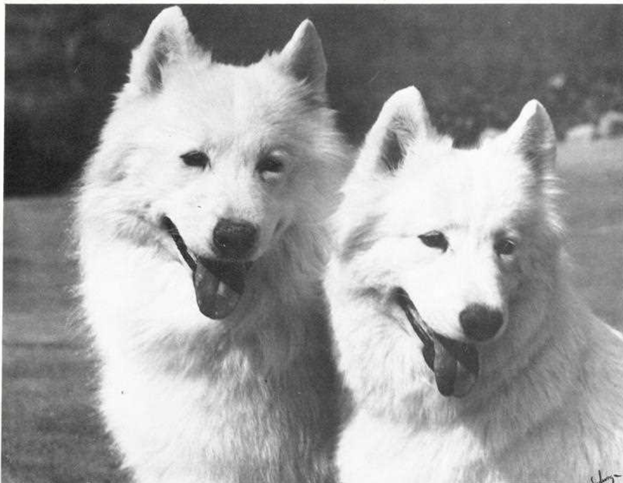
Ch. Kobe-Sur-Ruff of Encino