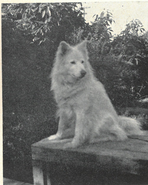
NANNUK—11 years 4 months