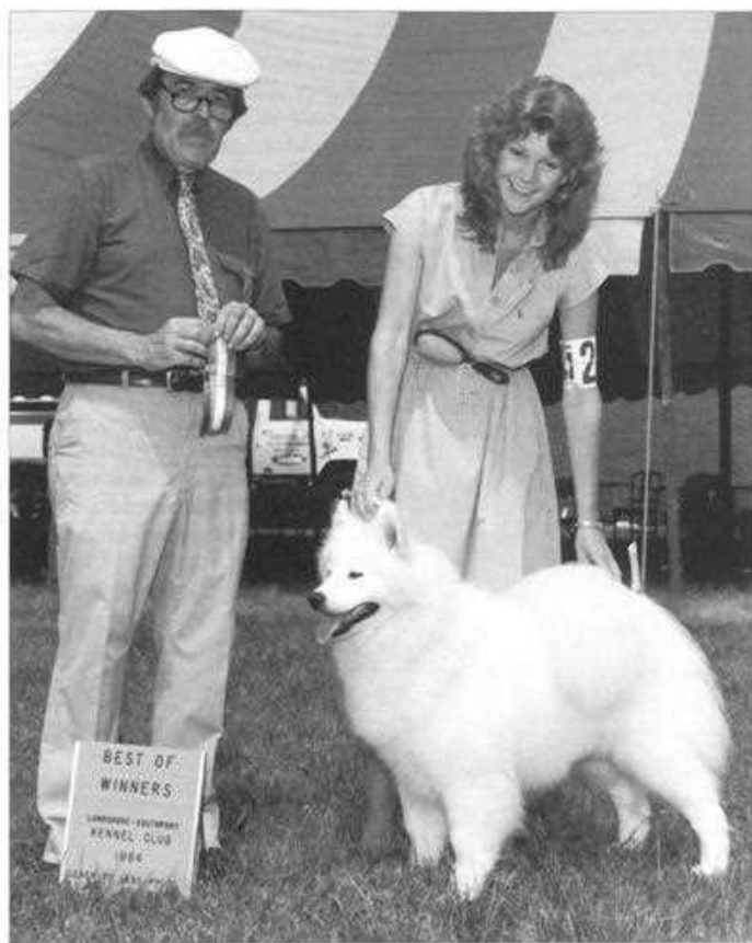
Ch. Tarahill's Elusive Dream (Ch. North Starr's King's Ransom x Ch. Montego's Lady in White CD).

bly important because with the depth of chest, you're not going to get the lung capacity.