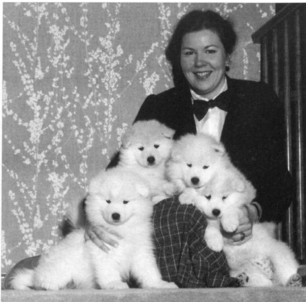
Litter by Ch. Tarahill's Casey Can Do x Ch. Tarahill's Elusive Dream. February 14, 1985.

handed him the ribbon, he said, "The next time you bring her up, give her a bath." (laughter) I know that was back in the early 1970's and I'd like to think things have improved, and they have; but unfortunately you still see some superior examples of the breed lose to less superior examples that are snow white.