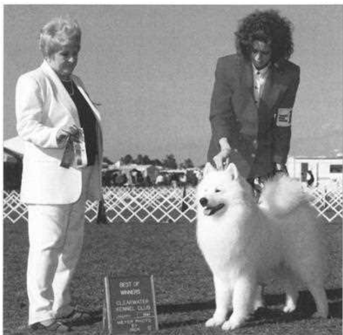
Ch. Tarahill's Bred to Win (Ch. Kazakh's Kodiak CD x Ch. Tarahill's Can Do Too).