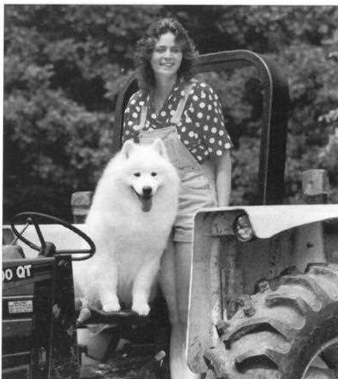
Ch. Tarahill's Everybody Duck. This ad said, "the real working dog."

You've used handlers a lot. Do you think a big-named handler helps