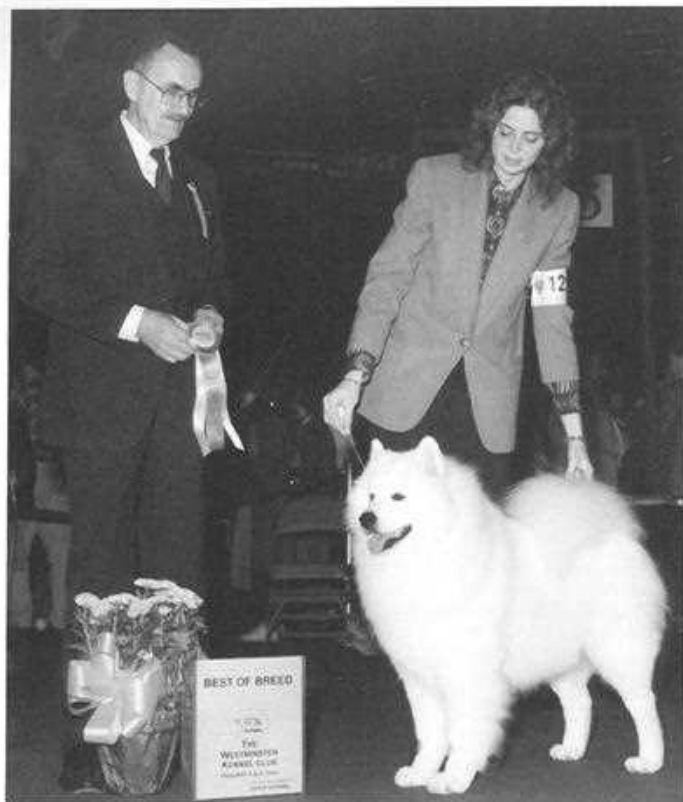
Ch. Tarahill's Everybody Duck winning BOB at Westminster, 1993.

Tremendously. Years ago when my late husband and I married, one of the first things that we did was to sell his house and sell my house and buy our house. We moved onto acreage out in the country, and it was quite a commute for him. He asked me then if I would like living there if I didn't have dogs? I remember looking at him and