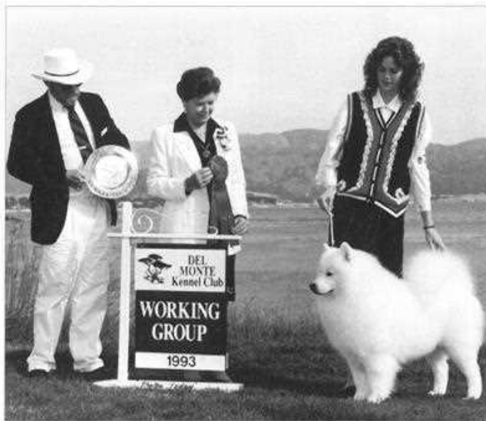
Ch. Tarahill's Everybody Duck.

For years and years and years, I fed Iams. I raised a couple of generations on Iams, and I think in the last couple of years they have changed their base, if you will. It's kind of an interesting phenomena that has occurred, and it has nothing to do with anything, except that it's one of those interesting things that has occurred. It's like mothers with babies: every pediatrician in the world will tell you that there is no reason for a baby who is teething to ever have a runny nose or a sore throat. Every mother of a toddler will tell you that babies will have a runny nose and sore throat when they teethe. All of a sudden, when I moved to Georgia, my dogs were missing