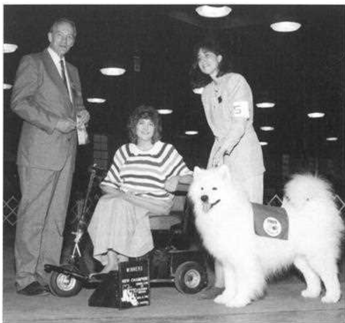
Ch. Tarahill's Treasure Me Always (Ch. Tarahill's Casey Can Do x Ch. Tarahill's Lucky Duckling). At the time, the only Samoyed and only champion of record of any breed to be a registered service dog.

perament in this breed, what do you have?