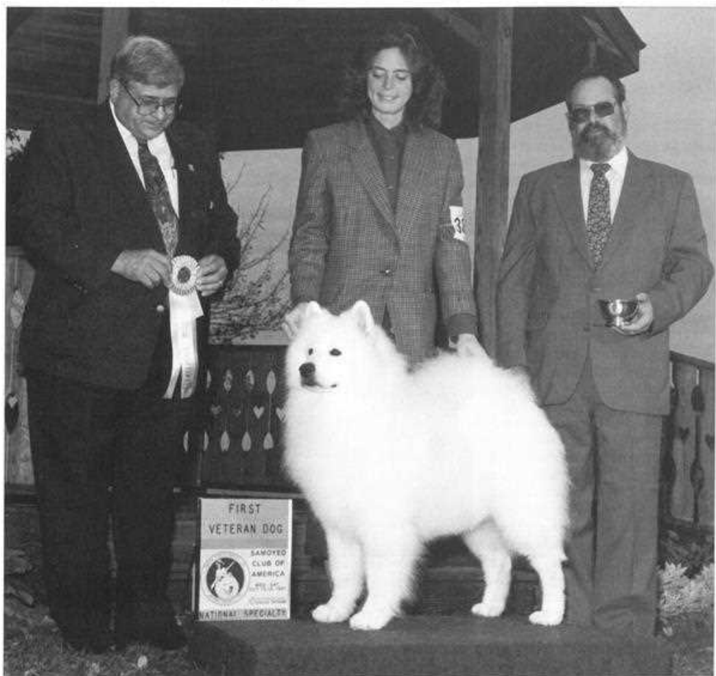
Ch. Tarahill's Everybody Duck winning the Veterans class at the 1997 National Specialty.

The same answer applies for novices: you can't force-feed anybody. Some novices come into this sport eager to learn and want to acquire all the knowledge they can. Some novices come into this sport eager to learn and in less time than it took me to get an OFA number on my first dog, they know more than I know today! In eighteen months in the breed, they have managed to acquire more knowledge than all of us old-timers have acquired in twenty or thirty years. It's available there if you have the right mindset.