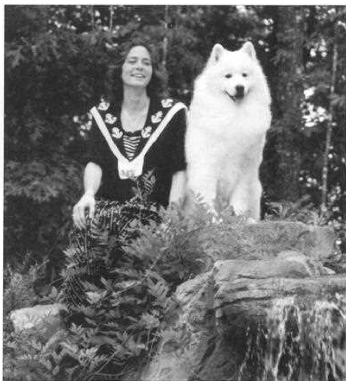
Ch. Tarahill's Everybody Duck.

old house they had their own puppy room, with tile four feet up the wall, next to my study because I thought that human socialization was important to the babies, that they not be in the kennel but in the house. Then when they got to be six to eight weeks old, they went out to the kennel. They didn't go in with the adult population. They still stayed isolated but in an area where there were lots of people. They were still in the middle of things, with people coming in and out of the kennel