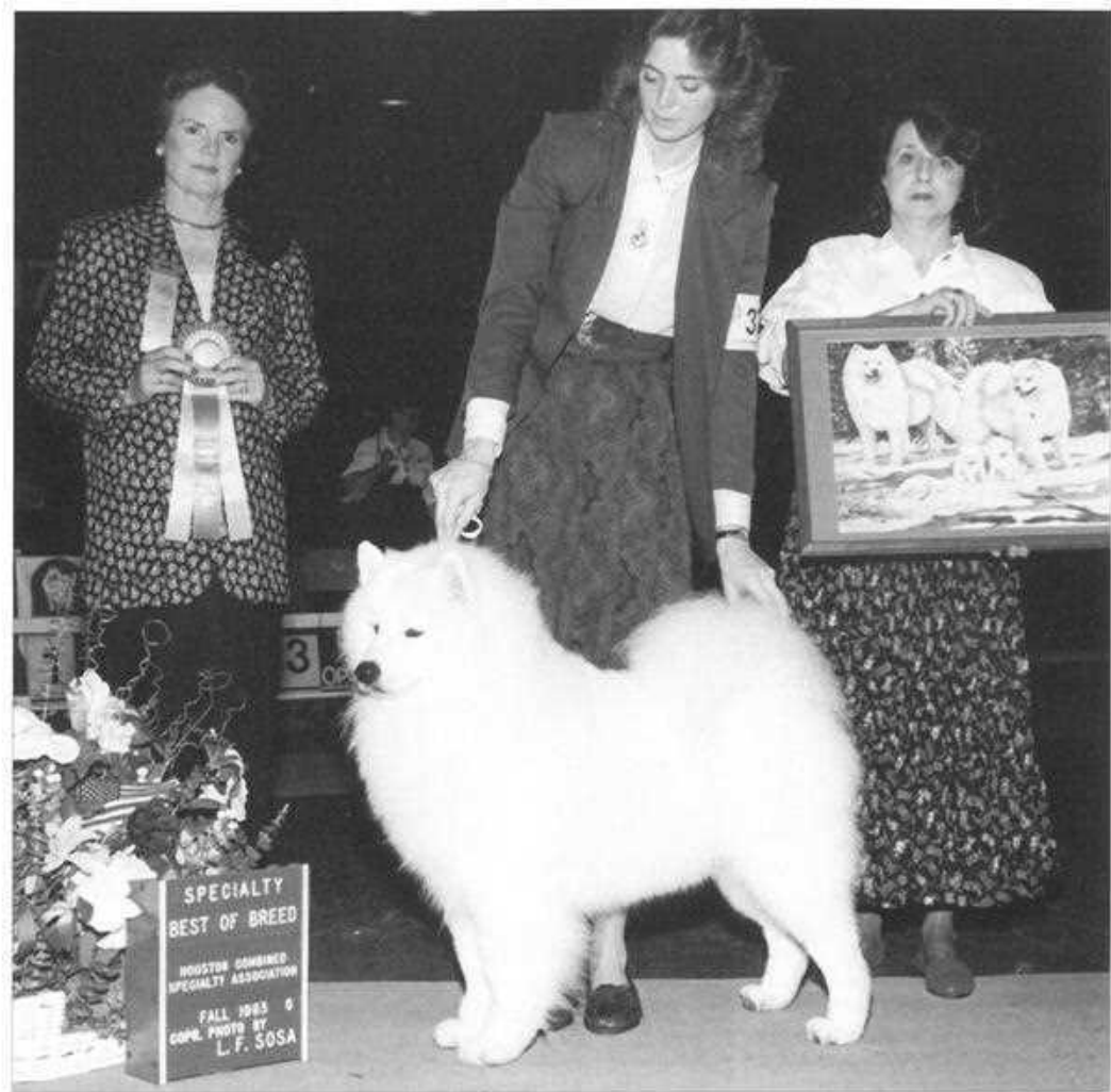
Ch. Tarahill's Everybody Duck.

No. As I said earlier, we didn't do a lot of breedings at my kennel. Even though I kept somewhere between fifteen and eighteen dogs around, it was