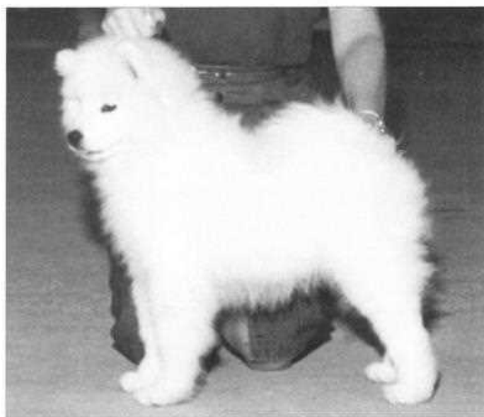
Tarahill's Winnie the Pooh.

I hate to say yes, but unfortunately there are too many judges out there who view the quantity of coat over the quality of coat. I have been very blessed, and I think it goes back to my foundation bitch being half-English because the English, generally speaking, have an abundance of coat. My dogs have always had tremendous coats and lots of it. I can't tell you that I've ever been penalized for it, but I have seen some very good dogs be penalized for not having the quantity of coat. Our standard specifically states