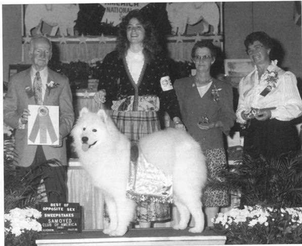
Ch. Tarahill's Rue the Day (Ch. Tarahill's Casey Can Do x Ch. Tarahill's Lucky Duckling).

Hmm, good question. I have not had a particular problem with bloat in my bloodline. I've only had one dog bloat on me but it was a deep-chested dog. When you look at the breeds that are prone to bloat, they are the deep-chested breeds. If you look at the Samoyed bloodlines that have had a problem with bloat, they tend to be the more deep-chested dogs. As a breeder, I would tell you that your job is to breed to the standard and the standard says that the chest should come to the elbow. In reality, not a lot of them probably do. It's proba-