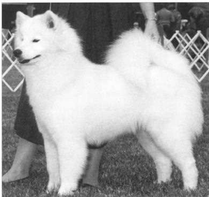
Ch. Tarahill's White Truffle (Ch. Whitecliff's Sarmik Karu CD x Ch. Tarahill's Last Edition Shada CD).

that the quality of coat should be considered more than the quantity of coat.