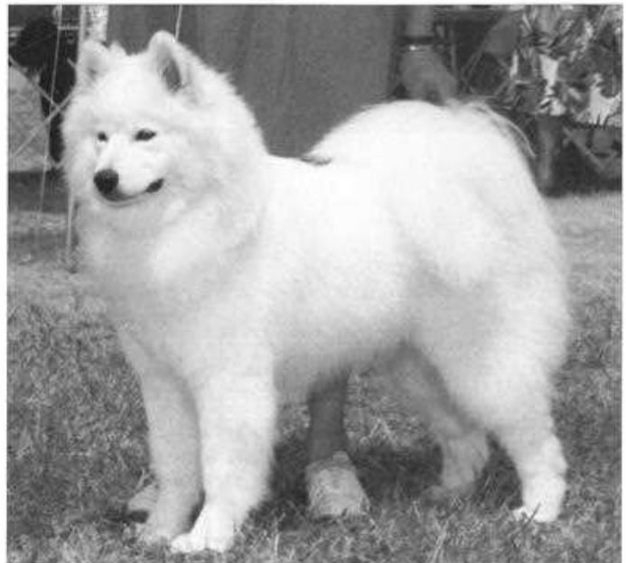
Ch. Tarahill's Lucky Duckling.

been back in the ring since then, and I had a young male who had never been in the ring and didn't have a single point toward his championship. I also had another dog who had done some Group winnings. I would tell them that my stud price was the same for every dog. The dog that has never been in the ring is the same price as the number one Samoyed in the country. I could do that because one dog was not necessarily better than another. This dog had just had more opportunity, more advertising and more money spent on him. That doesn't necessarily mean he was better. None of his faults got better when he won Best in Show. Nothing about this dog changed before he walked into