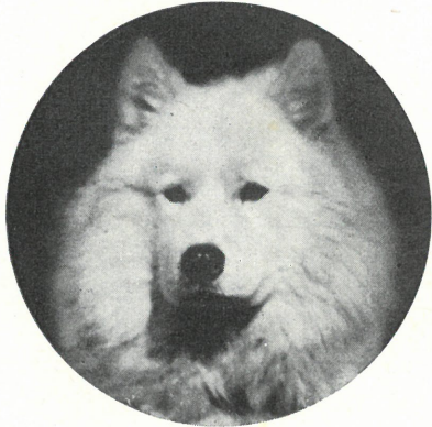
CH. NOVIK OF SNOWLAND

Before discussing some of the things we can and should do, your President desires to pay tribute to our Eastern Division, which in our heart and binds, should always be remembered as our parent club. This group, which has been from the be-