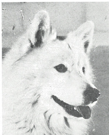
CH. FROST KING At Stud