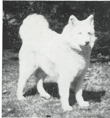
POLAR PRINCESS 1932 - 1947