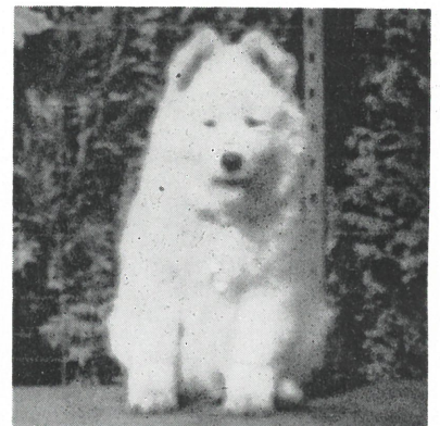
PUPPIES OF CHOICEST BLOODLINES