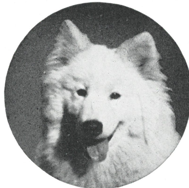
The White Christmas Sams