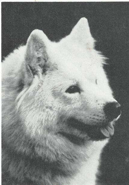
English and American Champion Princess Silvertips of Kobe