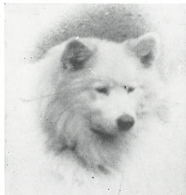
Puppies Occasionally — Selected Breeding Correspondence Invited