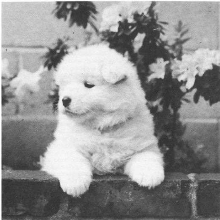
Belaya's I'm A Pepper Too at 6 weeks.