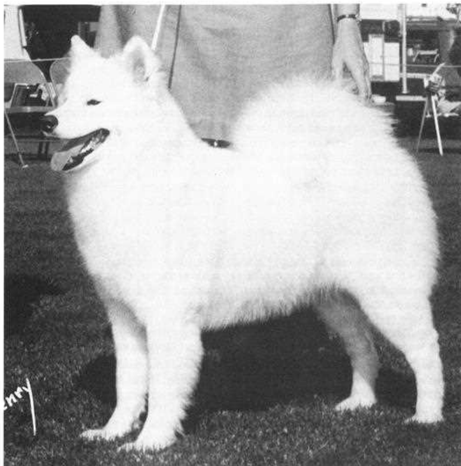
Ch. Belaya Taiga Lily.

veterinary attention or special care in terms of diet or anything else. He should only need his ordinary shots.