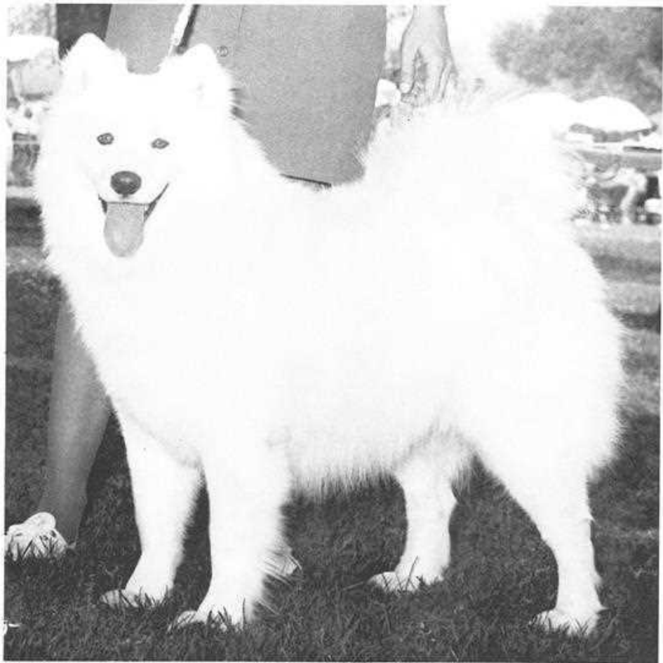
Ch. Nikkie's Nikole of Williwaw