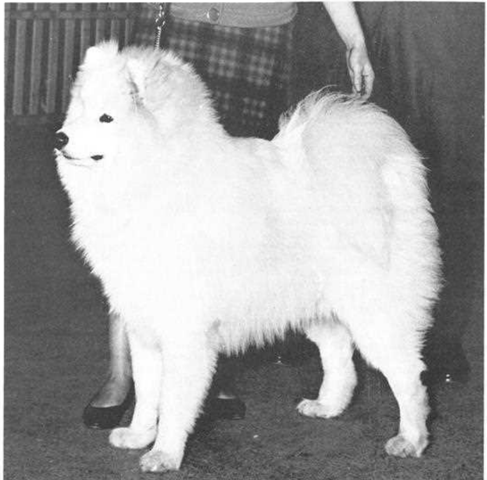
Ch. Williwaw's Czar Nikkolas - 8 months old. This is the best looking pup I ever showed.

You don't think there's necessarily a risk from the standpoint of the