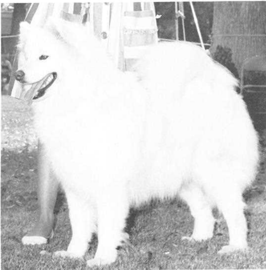
Ch. Anastasia of Frost River - one of 1st Brood bitches.

It would depend on where that shy temperament came from. If it