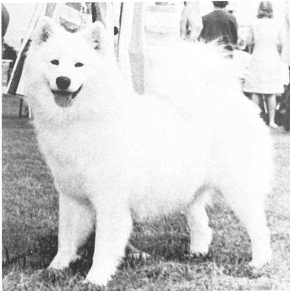
Ch. Truschka of Williwaw Ch. Buddy Boy of Williwaw x Kobe's Ronda of Encino

Who do you feel influenced you the most when you were just getting