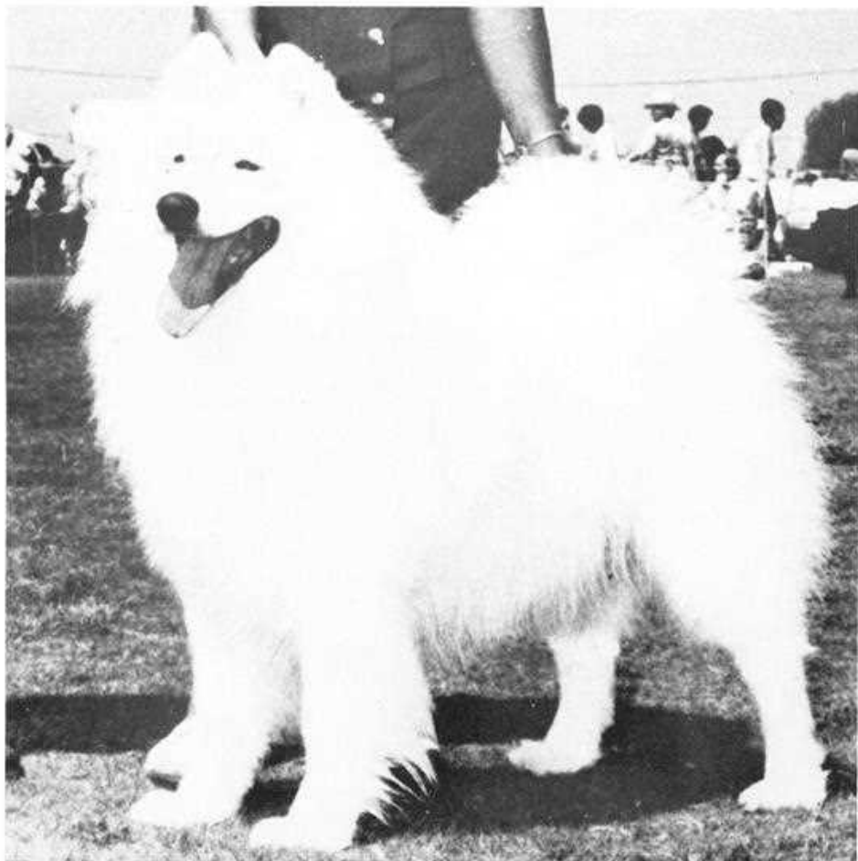
Ch. Mister of Williwaw

No, that really never meant that much to me. Even when I got into dogs that didn't really mean that much to me - who was the big winner at the time. Because I had an eye for a dog and I knew what I liked and how I wanted it to look. So, that really didn't mean that much to me. You can