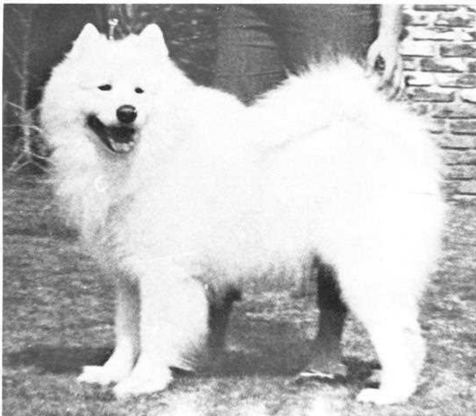
Ch. Buddy Boy of Williwaw