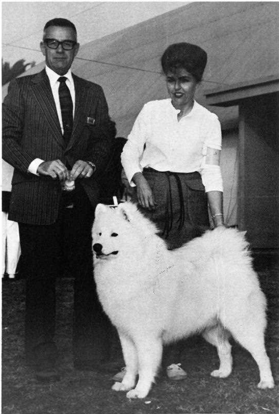
Duster - January 16, 1972, Ventura - two points.