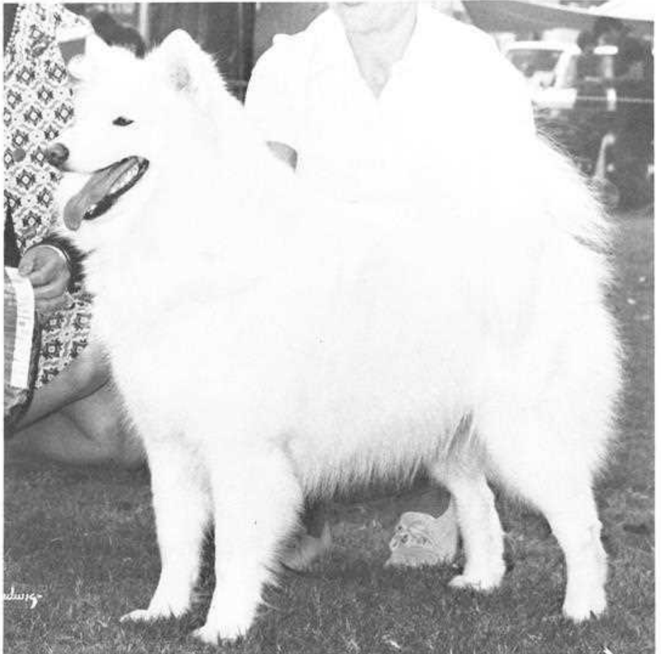
Nickolo's Mistique Williwaw Ch. Misti of Williwaw x Ch. Nikkie's Nekole of Williwaw

When you were in dogs and had, say, four or five and wanted to go off on a show weekend or vacation, you